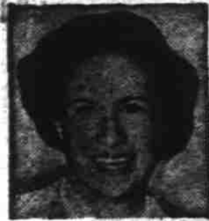
Sports MAUREEN CONNOLLY