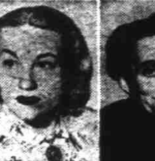
Music DOROTHY KIRSTEN