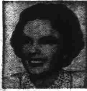
Theater JUDY GARLAND