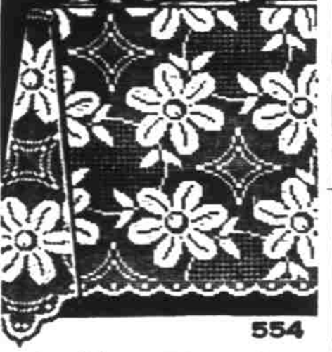
554 by Laura Wheeler

JUST SIXTEEN squares crocheted in string will make a lunch cloth! With edging added, it will be over 44 inches. Interesting to make — filet-crochet with mesh and K-stitch background. Big square 11 inches in string. Pattern 554; charts; directions. Send TWENTY-FIVE CENTS in coins for this pattern to The Oregon Statesman, Needlecraft Dept., P.O. Box 5740, Chicago 80, Ill. Print plainly PATTERN NUMBER, your NAME and ADDRESS with ZONE. Such colorful handwork ideas! Send Twenty Cents in coins for our Laura Wheeler Needlecraft Catalog. Choose your patterns from our gaily illustrated toys, dolls, household and personal accessories. A Free Pattern of a handbag is printed in the book.