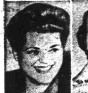
Movies JUDY HOLLIDAY