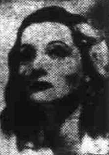
Science DR. FLORENCE SABIN