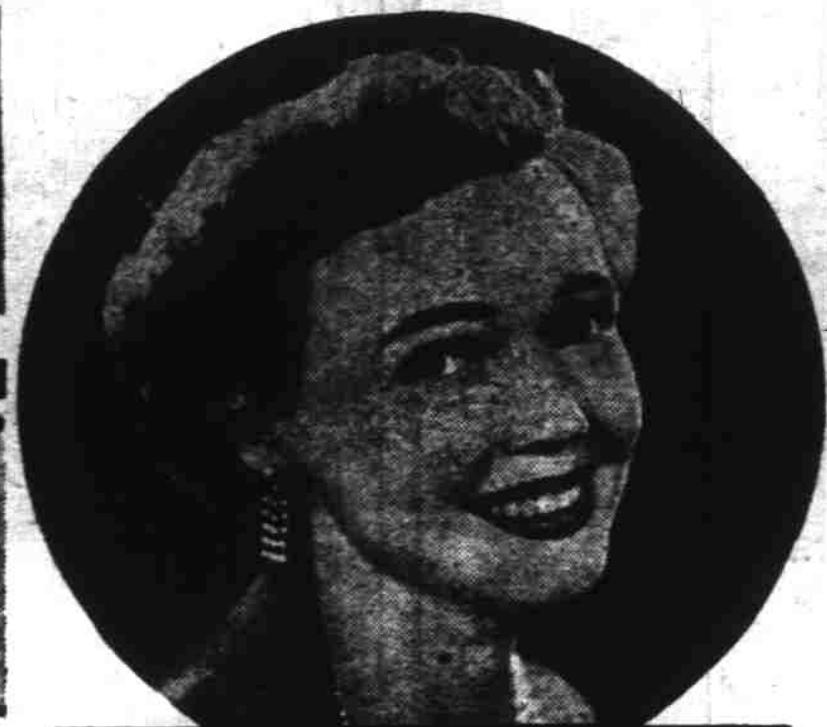
WOMAN OF THE YEAR MARGUERITE HIGGINS