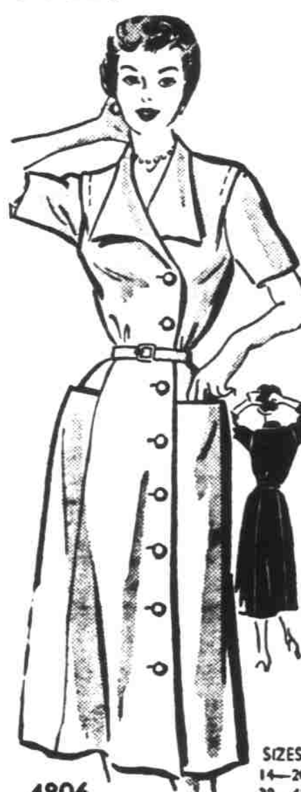
4806 by Anne Adams

ENJOY COMPLIMENTS? You'll get plenty when you make this beautiful classic! Has such flattering lines and such new fashion details, yet it's simplest sewing. Shown here in a plain fabric, it's equally stunning in print, plaid or check!