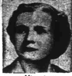
Literature RACHEL CARSON