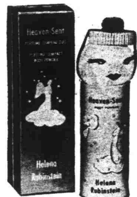
Perfume Chapeau Duo—Helena Rubinstein's perfume compact for your purse, in the adorable bonnet package, teamed with shaker box of Body Powder! Choice of White Magnolia, Heaven-Sent or Apple Blossom, 2.00. Plus tax.