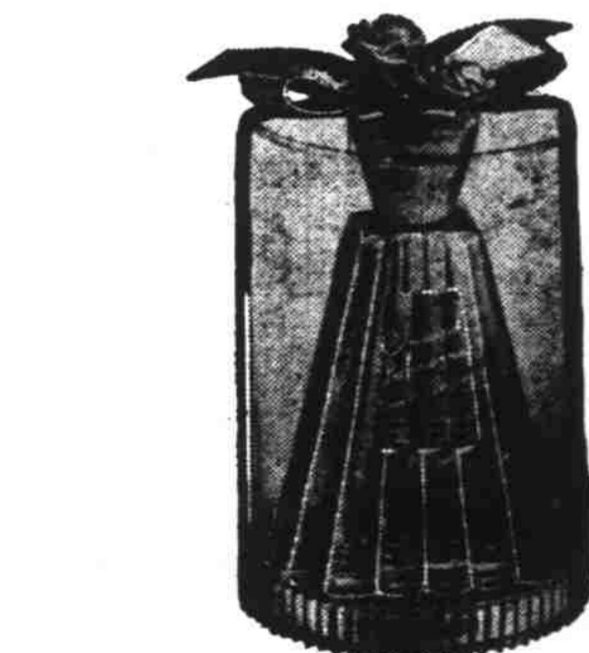
Crystalite Solo—The beautiful crystal-like cylinder holds Helena Rubinstein's famous Command Performance Eau de Parfum. 2 ounces 2.00. 4 ounces 3.25. Also 4 ounces also in either fascinating White Magnolia Cologne or delicious Heaven-Sent Eau de Toilette at 2.25. Prices plus tax.