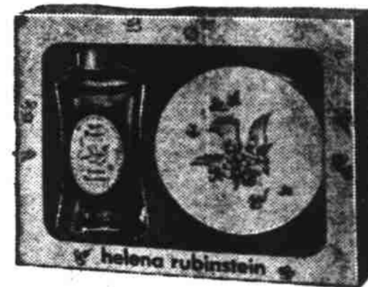
Window-Box—Picture window shows Helena Rubinstein's big bottle of Cologne and a box of Body Powder (with puff). Both in sprightly Apple Blossom at 2.75. Plus tax.