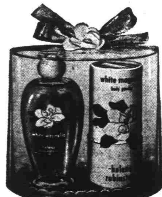
Crystalite Duo—Inside the big crystal-like cylinder—Helena Rubinstein's White Magnolia Cologne and shaker of matching body talc. Also in Heaven-Sent. 2.95. Price plus tax.