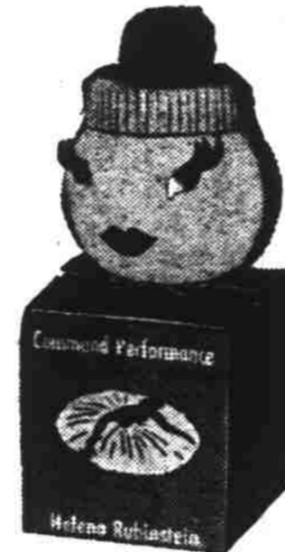
Perfume Compact Chapeau—Here's Helena Rubinstein's perfume compact (it's solid perfume packed to tuck in a purse) masquerading as a winter bonnet. In White Magnolia, Heaven-Sent, Command Performance, or Apple Blossom. 1.25. Plus tax.