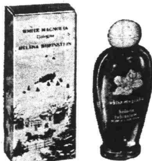
Sleighriders—Behind the cheering winter scene is a generous 2-ounce bottle of exquisite White Magnolia Cologne at 1.25. Or have the Sleighride box in a Body Powder-and-puff set at 1.25. (Also Sleighride boxes in Heaven-Sent, Apple Blossom and Command Performance.) Prices plus tax.