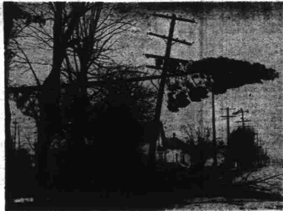
LEBANON, Dec. 5—A wind-felled tree made this startling picture on Lebanon's North Main street, just north of the high school, in Tuesday's big windstorm.