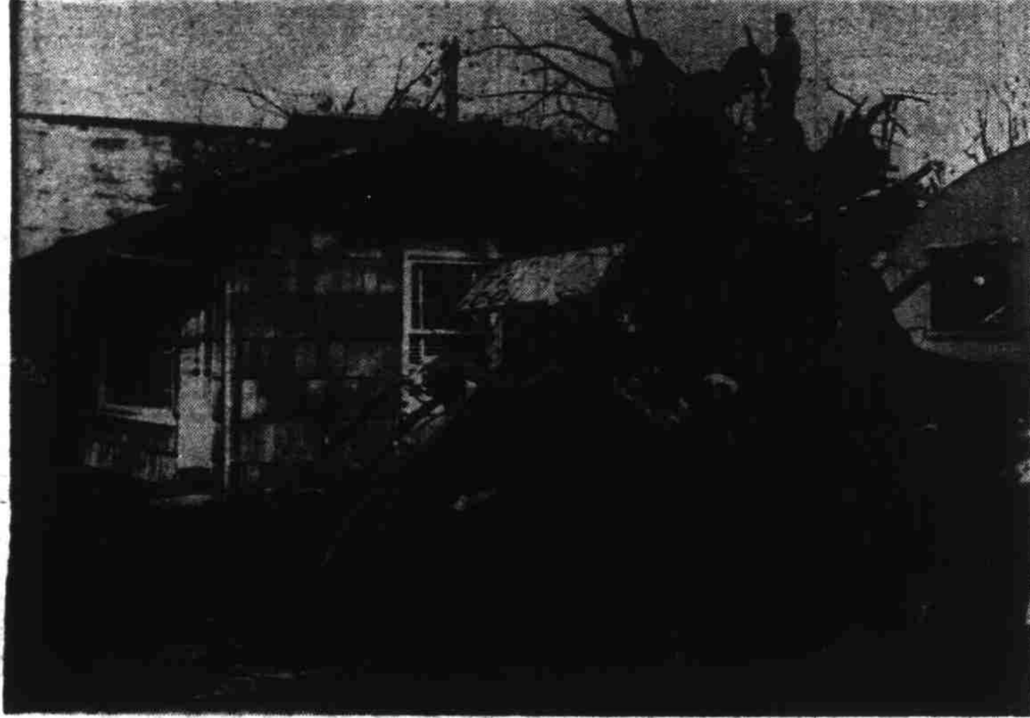
LEBANON, Dec. 5—Huge roots loom alongside Western Wood Products office structure, above, after Tuesday's windstorm uprooted an 80-foot poplar and tumbled it onto roofs of the office and the Eggen Photo Studio building (background).