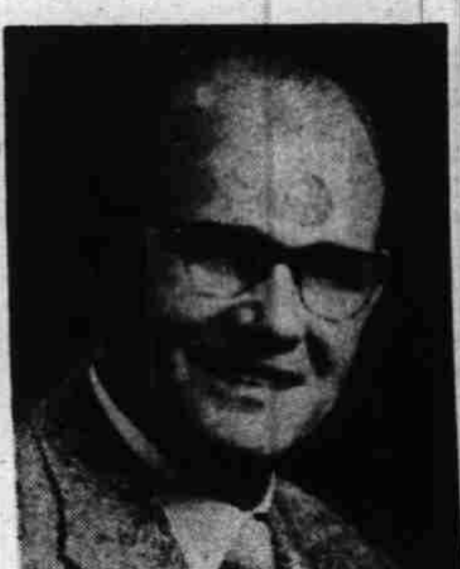
CARL LAGERFELD MANAGER

Of Salem's Most Beautiful, Most Modern Food Store Conveniently Located in the Heart of Salem 1265 CENTER STREET