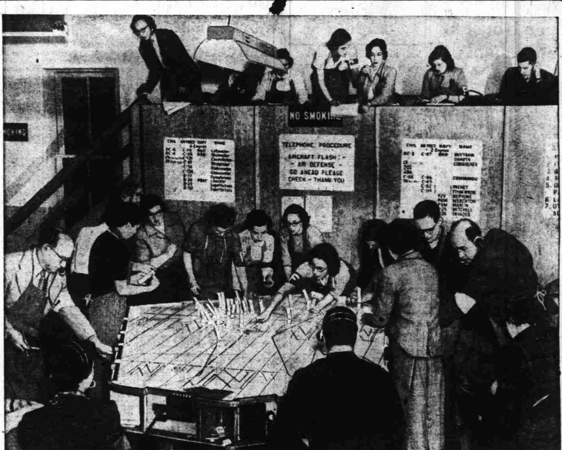
Air Defense Filter Center: Telephone lines link these vital posts with the nation's far-flung air defense radar network.