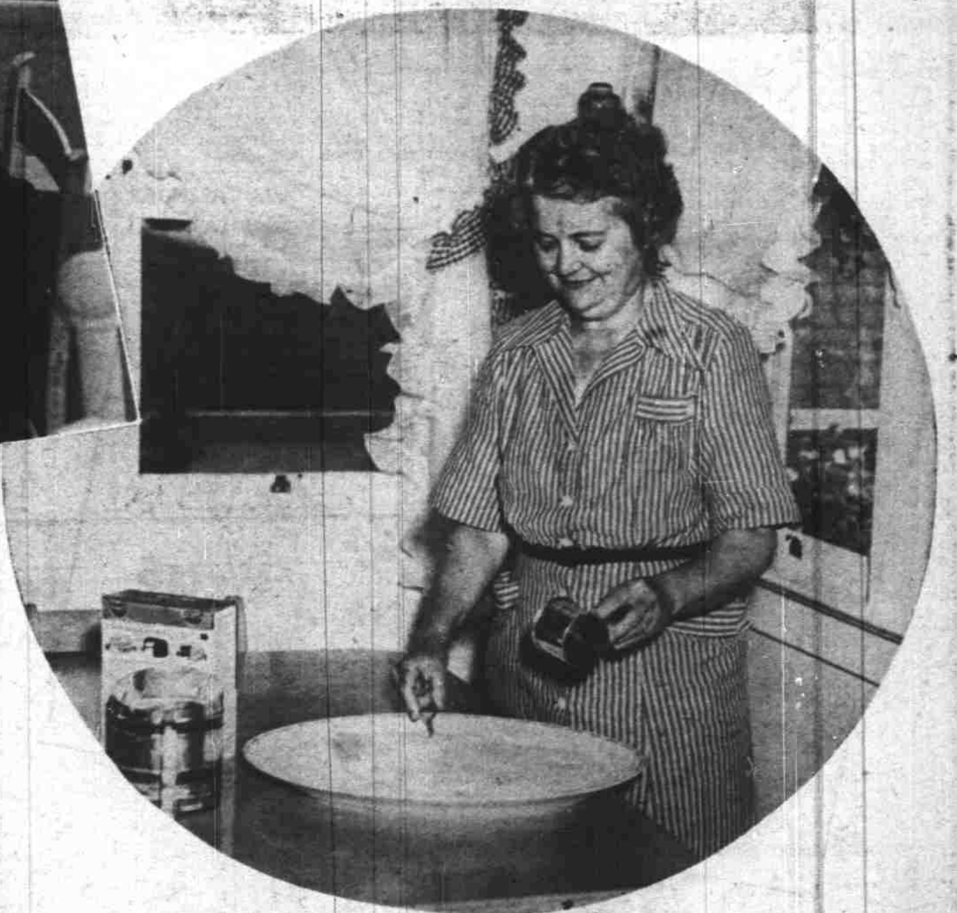
Even in busy times housewives find time to bake a cake for the state fair culinary department and no exception to this is Mrs. Douglas McKay, wife of Oregon's governor, who will enter one of her famous angel food cakes this year. After beating the egg whites on a platter with a wire whip Mrs. McKay is shown about to add the sugar, a tablespoon at a time.