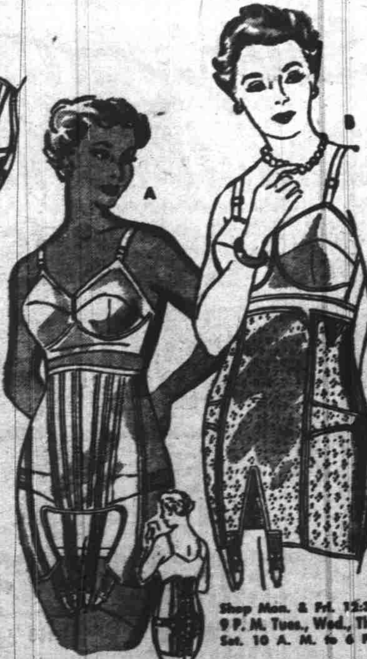
B. For Sacro-iliac Support 8.59

Long back and sides for good thigh control. Properly boned fine cotton coutil with large elastic release at waist. 15-in. length, sizes 28-40.