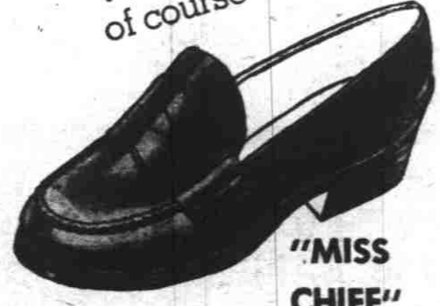
"MISS CHIEF" ...