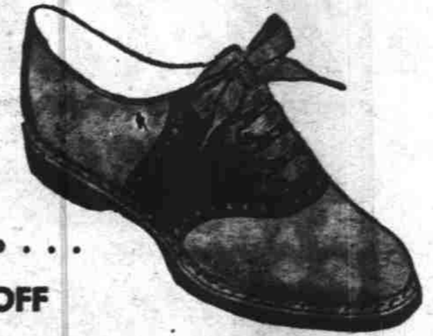
the... "OFF WHITE"