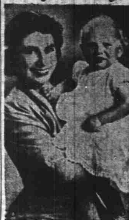
LONDON, Aug. 16—Princess Anne Elizabeth Alice Louise, third in succession to the British throne, looks serenely from the security of her royal mother's arms on her first birthday. The baby daughter of Princess Elizabeth and the Duke of Edinburgh, wears the same coral necklace as was worn by her mother for a similar first anniversary portrait in 1927.