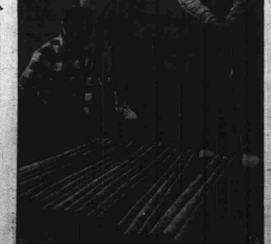
READY FOR HIS CUT—John J. McCoy, U. S. High Commissioner in Germany, cuts a hot bat before going to play during softball game in Frankfurt Military Post League. The Communist, after choosing a good wood, made two hits, one with bases loaded.

BATON ROUGE, La., Aug. 16—(AP) —Exploding fuel storage tanks killed two Esso Standard Oil refinery workers and injured 11 others in an early morning blast that shook the entire city today.