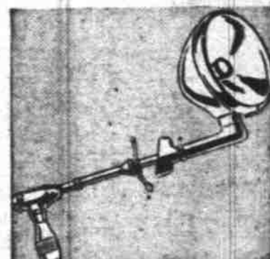
Right Hand Spotlight

Priced for Savings Reg. 13.95 . . . . . 4.88