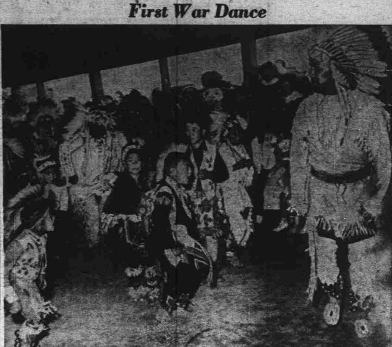
Little Indians at the annual encampment near Nespelem, Washington, on the Colville reservation are led by an elder in their first war dance. This is a big event in an Indian lad's life. His parents give presents to persons in the crowd to celebrate the occasion. The three-day encampment, which ended July 7, drew Indians of many tribes.

The market is across an alley from the Warren avenue police station.