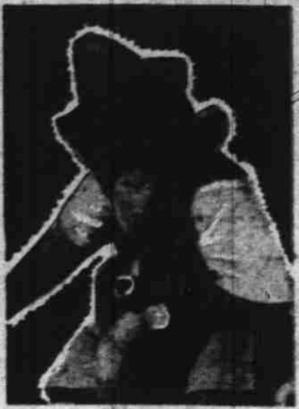
CHEETA Shows at bowl. Catching of the greased pig and climbing the greased pole, always

Hollywood bowl, usually the home of auto racing for Salem, adorns new splashes today and tonight as the Valley Sports organization presents its day-long program of varied Fourth of July entertainment.