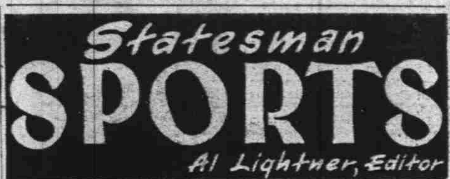
The Statesman, Salem, Oregon, Wednesday, July 4, 1951