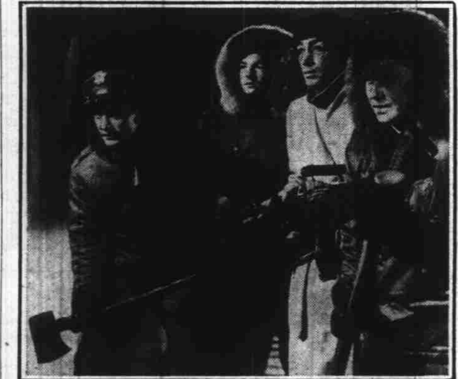
In celebration of its 25th anniversary, the management of the Elsinore theatre presents RKO-Radio's epic screen adventure-thriller, "The Thing," starting today. In the scene above, the Arctic explorers prepare to try to destroy the indestructible menace from another world.