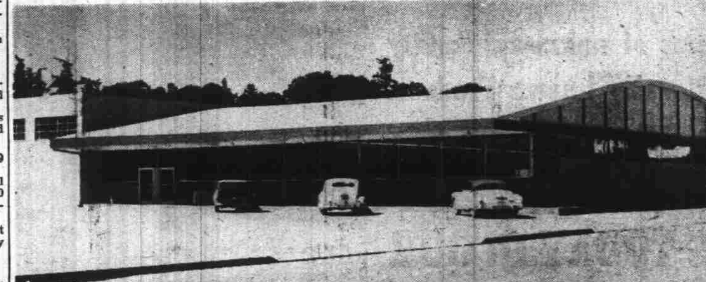
This photo of the new Erickson Super Market was taken before doors were open for business.