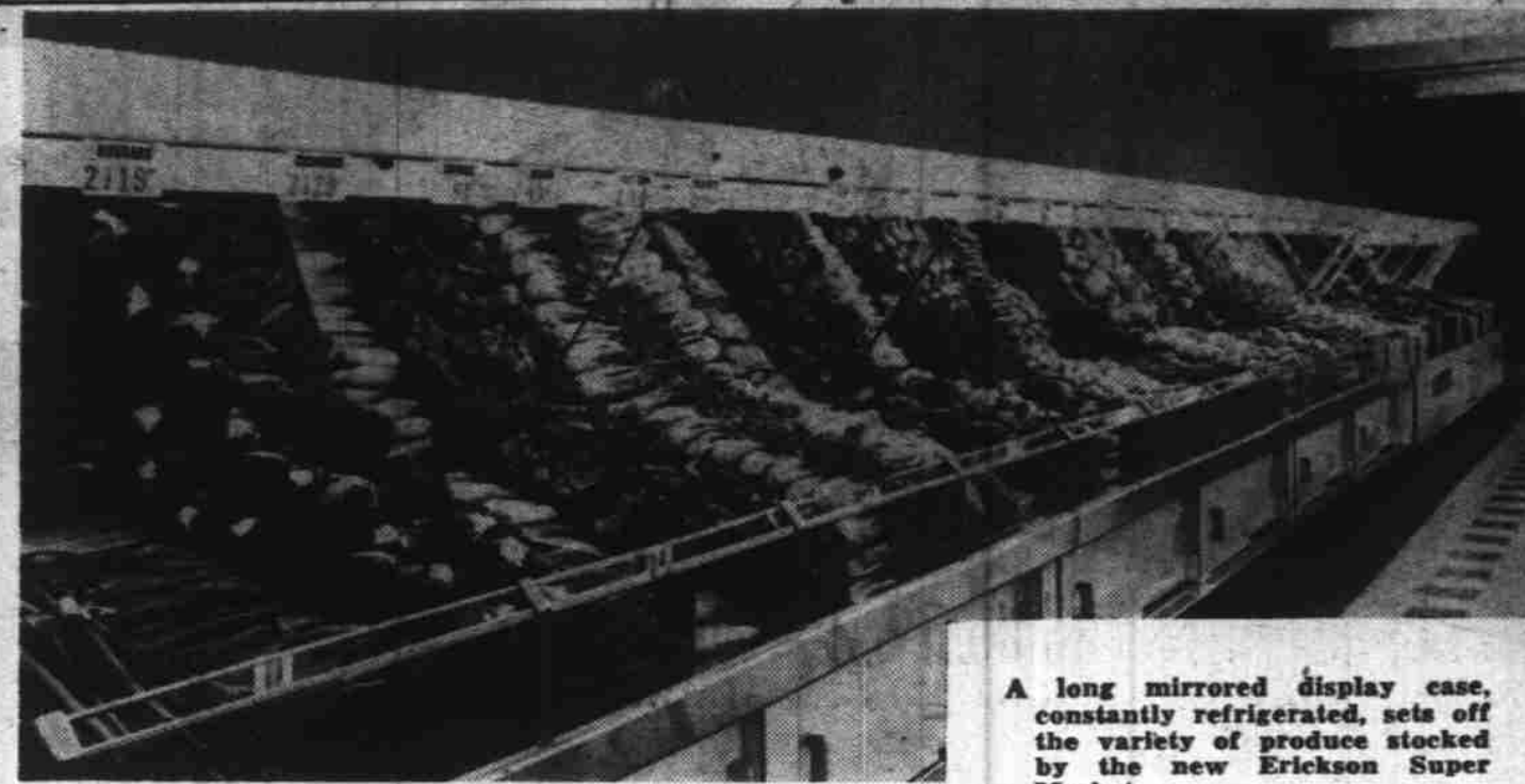
A long mirrored display case, constantly refrigerated, sets off the variety of produce stocked by the new Erickson Super Market.

Nearly 100 cars may be parked at the new Erickson Super Market at 2820 S. Commercial st.