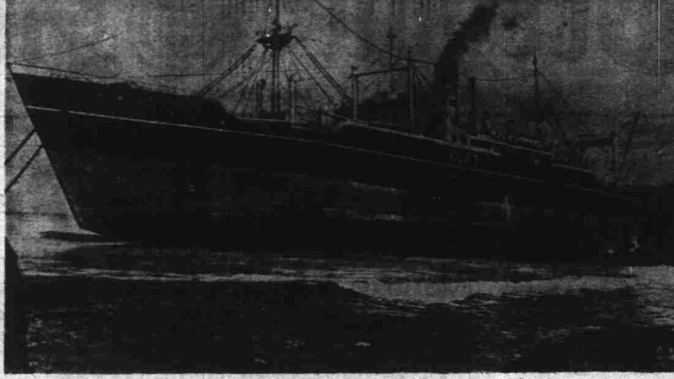
SAN FRANCISCO, April 29—The 7,000 ton Japanese freighter Kenkoku Maru, with 54 persons aboard, off its course in a heavy fog and blinding rainstorm ran almost up on the beach near Stewart's Point, Calif., some 80 air miles north of San Francisco. (AP Wirephoto to The Statesman).