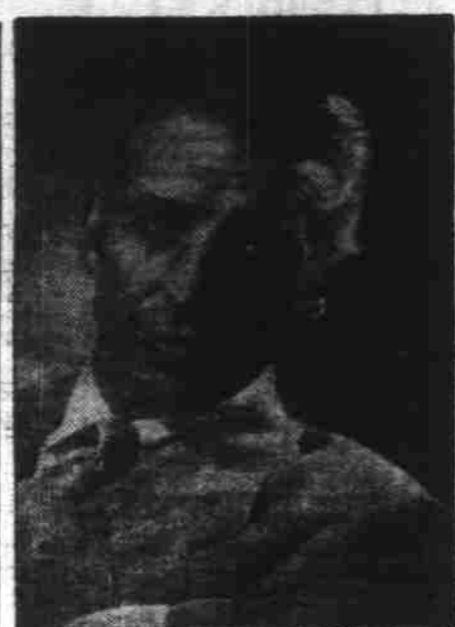
Stan Kenton, who with his 20 piece dance band will come to Willamette university gymnasium May 7 for a one-night engagement.