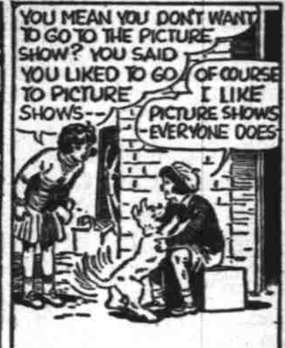
PICTURE SHOWS IS SWELL, E BUT THEY AIN'T REAL — ZERO IS SWELL AND HE IS REAL, AN' I WANNA HAVE A HEART TO-HEART TALK