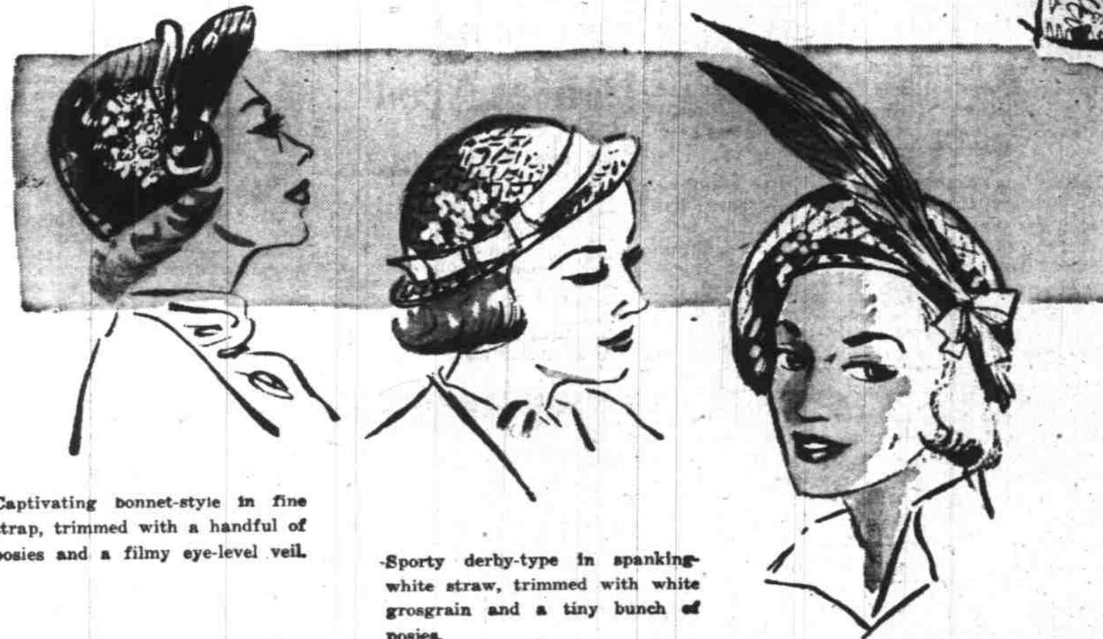
Captivating bonnet-style in fine strap, trimmed with a handful of posies and a filmy eye-level veil.