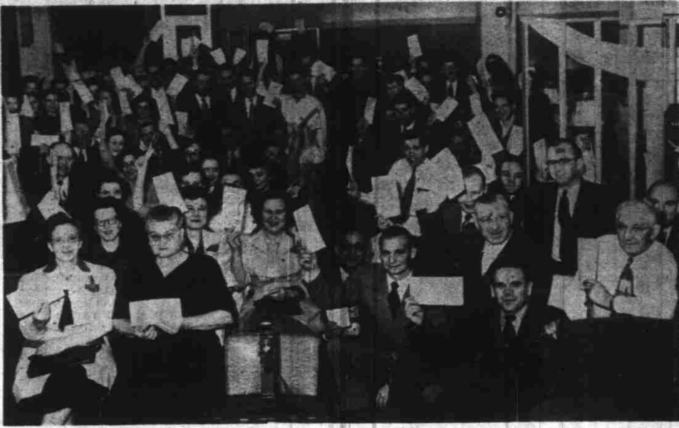
These happy employees of Sears, Roebuck & Co., wave their savings and profit sharing statements Thursday at a meeting of the employees to hear that they have an accumulated $230,033.