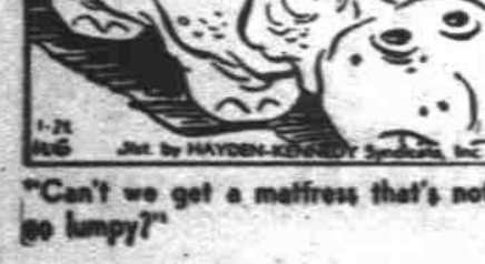
"Can't we get a waitress that's not so lumpy?"