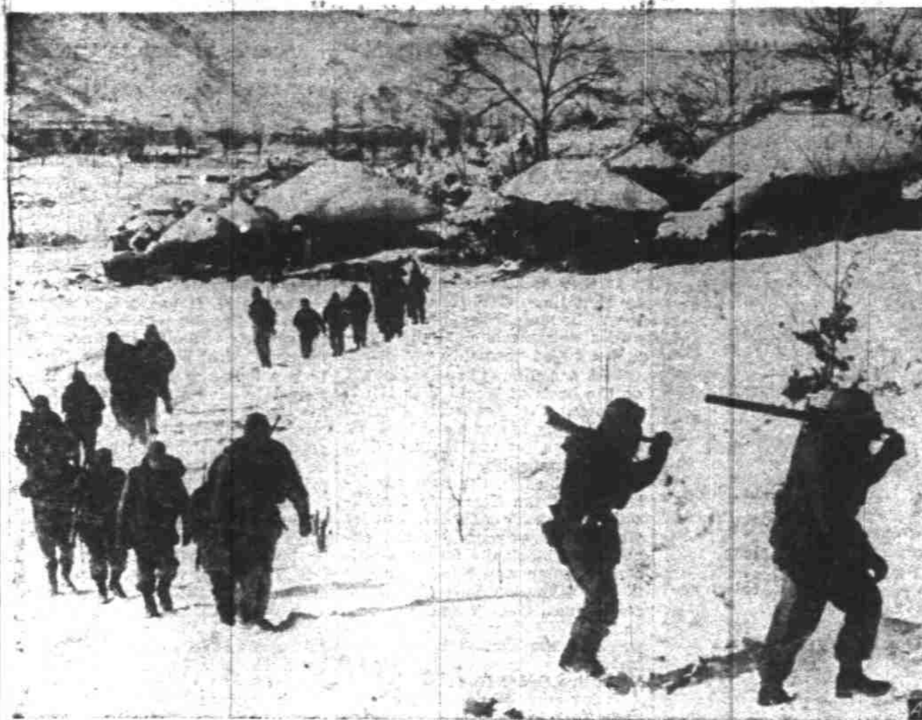
TOKYO, Jan. 20—Well-armed infantrymen moved up hill in Wonju front sector as Allied forces launch attack against enemy-held hill in subzero temperature. United Nations troops fought their way back into Wonju as Red forces were routed in snow-mantled east central Korea. The Reds later recaptured the town.