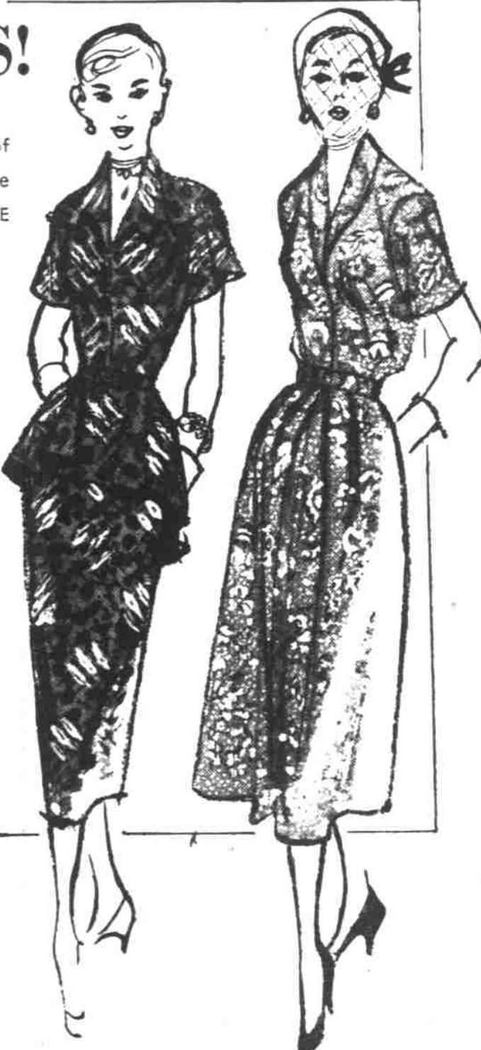
PENNEY'S DOWNSTAIRS STORE