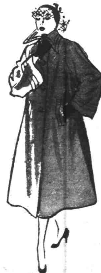
PENNEY'S DOWNSTAIRS COAT SALON

PAY CASH & CARRY IT... NO THRIFTIER WAY TO SHOP!