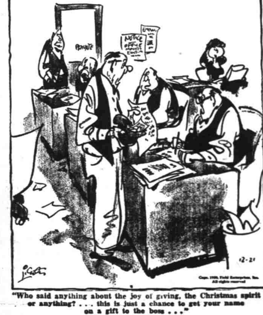
"Who said anything about the joy of giving, the Christmas spirit or anything? ... this is just a chance to get your name on a gift to the boss ..."