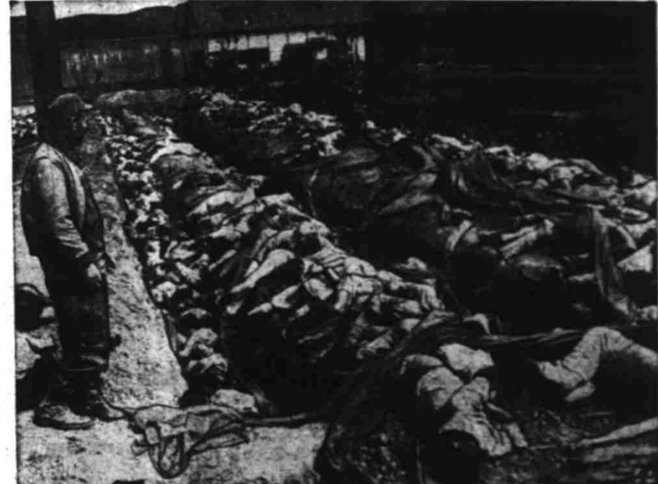
ROWS OF CIVILIAN KOREAN DEAD —Bodies of some 600 South Korean civilians lie in and around trenches in the prison yard at Taegon, South Korea, in September. Retreating North Koreans had bound and slain civilians before Communist forces were driven from city.