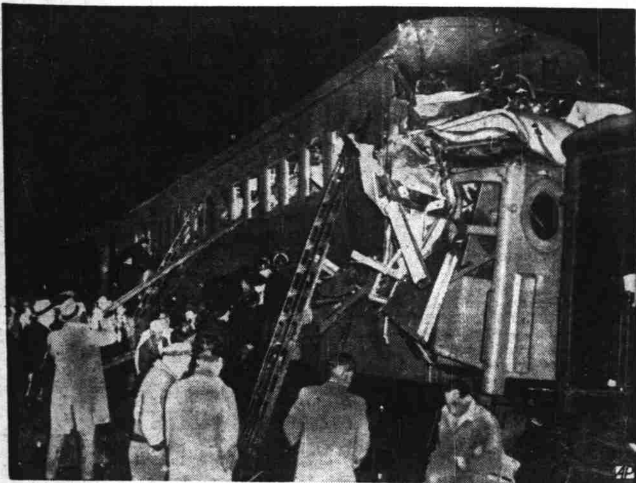
NATION'S WORST RAIL TRAGEDY —Two passenger cars of Long Island Rail Road were telescoped in most tragic train wreck of 1950, with 78 dead, in Queens, New York, Nov. 22.