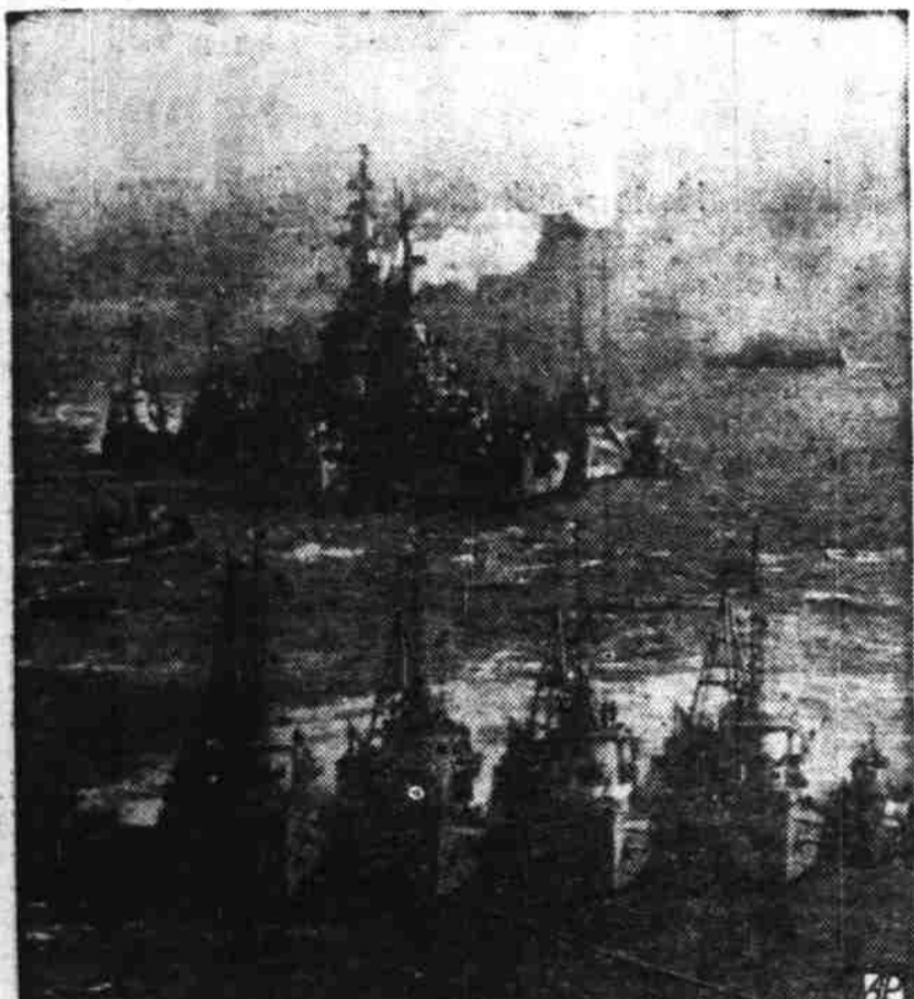
MOVING THE MO —January of 1950 saw nation's only battleship on active duty, U. S. S. Missouri, stuck on a Chesapeake Bay mudflat. Here tugboats strain to budge the Mighty Mo.