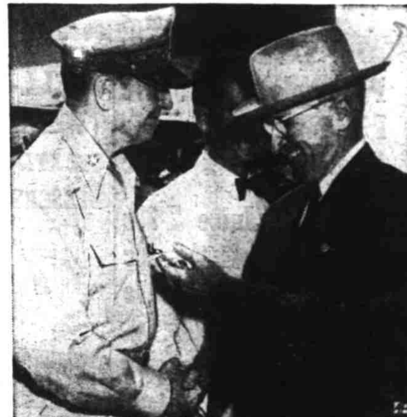
TRUMAN HONORS MACARTHUR —When President Truman and General Douglas MacArthur met for first time on Wake Island in mid-October, the chief executive pinned another cluster on MacArthur's Distinguished Service Medal.