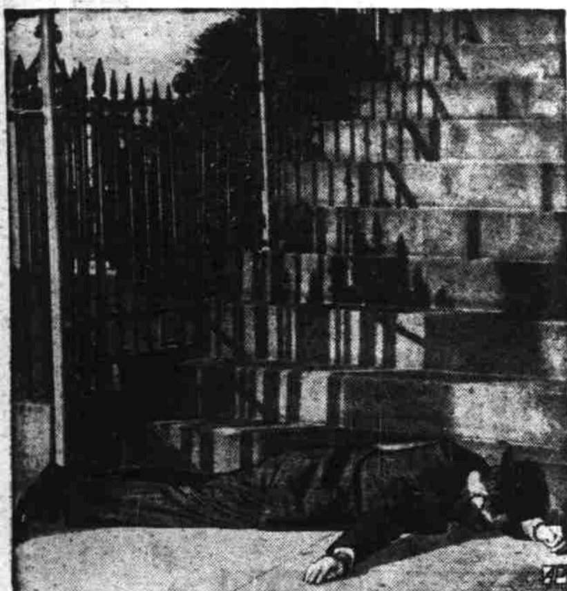
AFTER BLAIR HOUSE BATTLE —November 1 brought gunfire to Washington as two assassins tried to kill President Truman at Blair House, his home. One gunman, Oscar Coliazzo, lay wounded at bottom of Blair House front steps and second was killed by President's police guard. One guard lost his life.