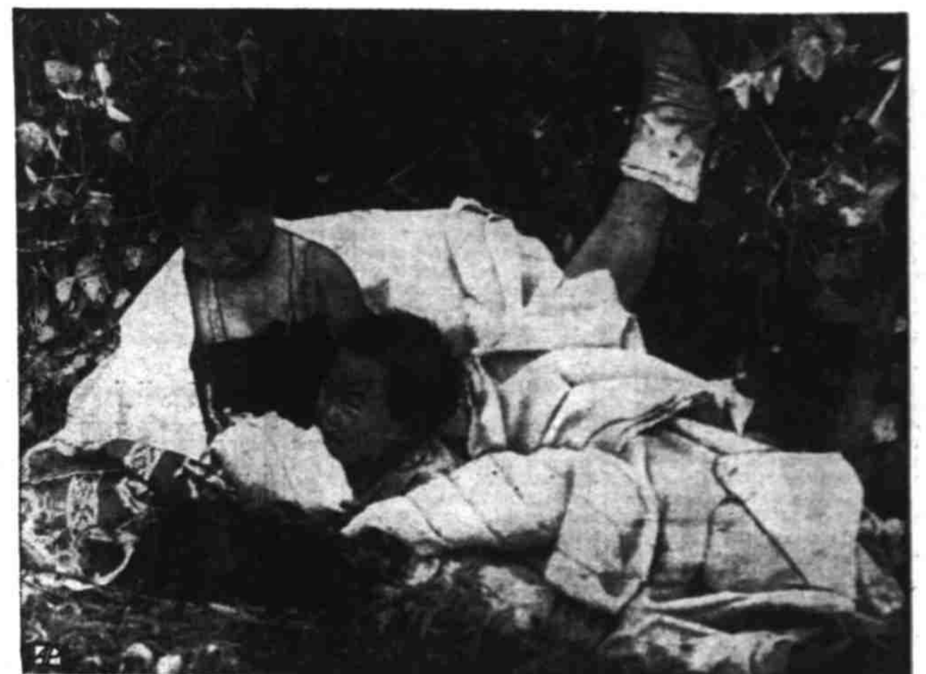
ORPHANS OF WAR —A crying Korean child and an older sister, alongside the body of their dead mother near Pyongyang, presented a tragic spectacle among war's non-combatants.