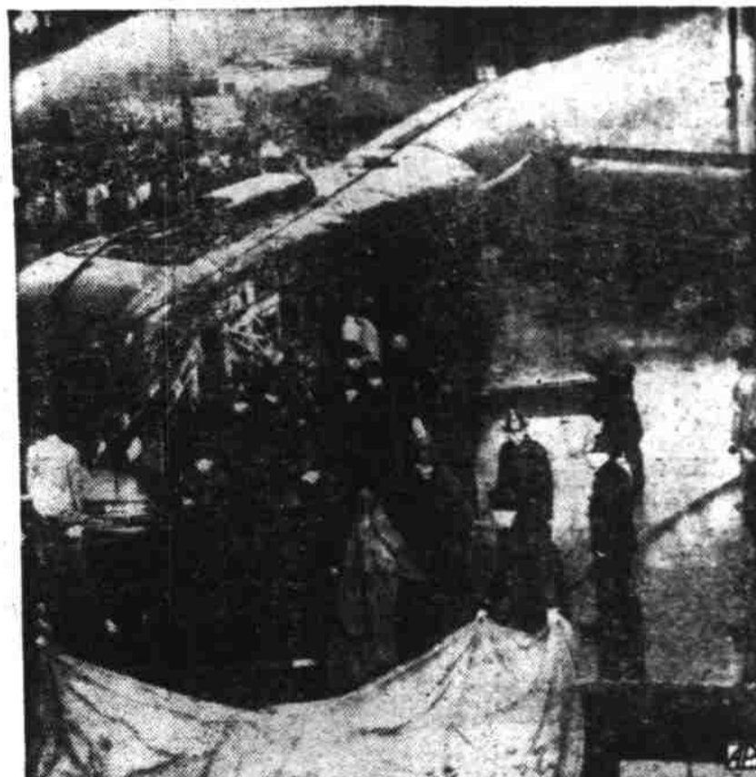
CHICAGO'S DISASTER —Firemen and rescue workers remove bodies of more than 30 victims after crash of a street car with a gasoline truck in Chicago last May 25. Car passengers were trapped as the truck's gasoline set the trolley afire.