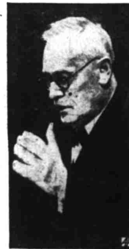
SOVIET'S SPEAKER —Soviet Russia's Foreign Minister Andrei Vishinsky (above) continued his policy of pouring vituperation onto United Nations action in Korea.