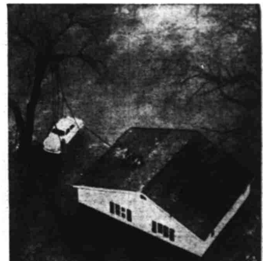
AFTER THE DELUGE —In 1950's major flood last May in Winnipeg, Manitoba, necessity was the mother of invention as this car owner rigged up a rope and pulley from a tree to save his car, while bicycles were lashed to the roof of his home.