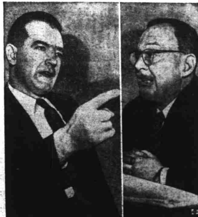
IN BATTLE OF WORDS —Wisconsin's Sen. Joseph R. McCarthy (left) wagged demonizing finger often in 1950 as he made charges of Communist infiltration in State department. Owen Lattimore (right), April 15, in Washington, denied McCarthy's allegation that Lattimore was "Russia's top spy" in U. S.