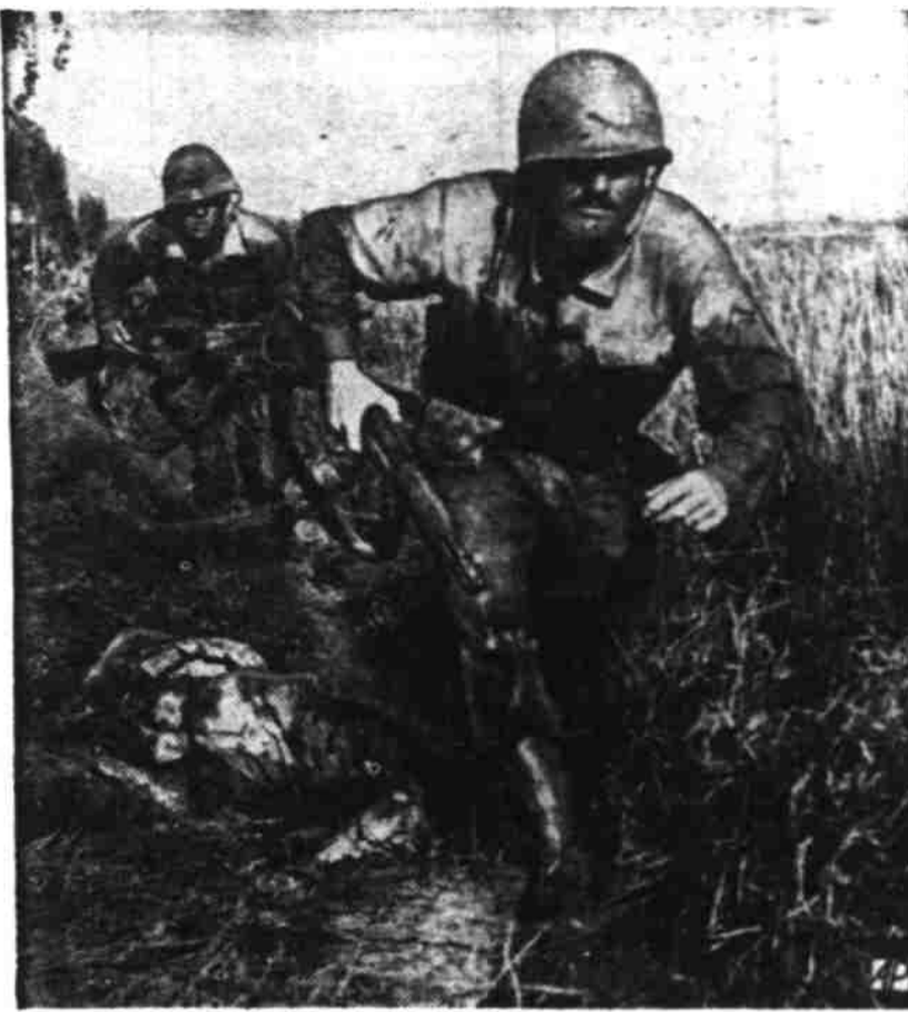
OFFENSIVE IN KOREA —Symbolic of Allied forward movement in Korea were onrushing Marines in September, moving past corpse