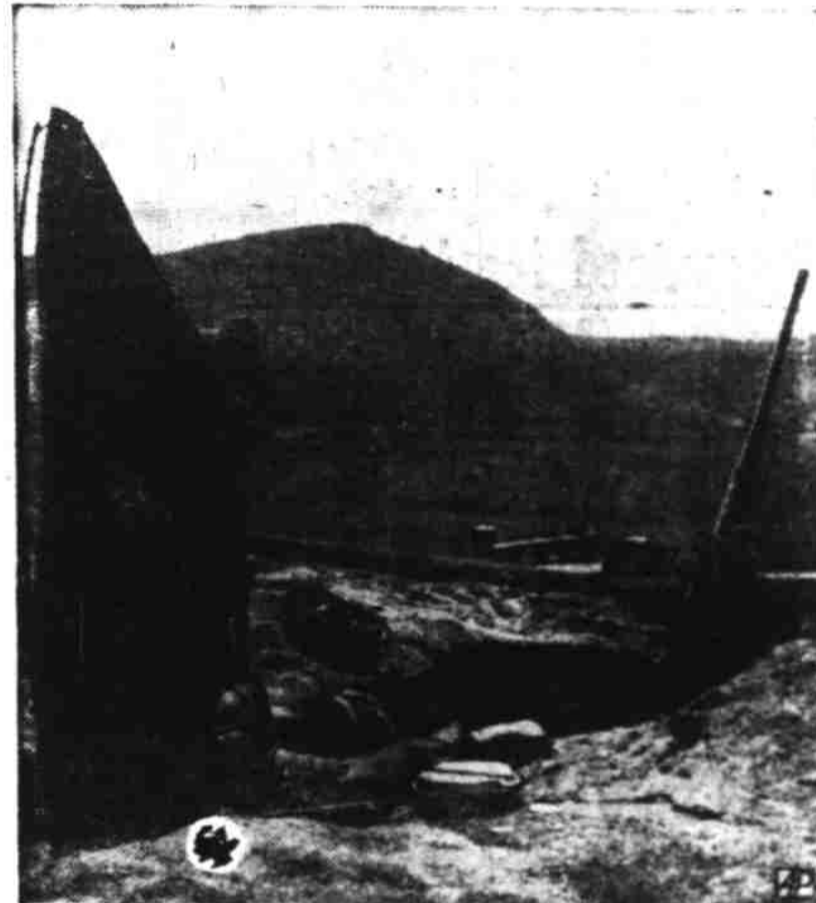
REST IN KOREA —Weary from long duty, this U. S. soldier slumped down to rest alongside his machine gun dugout on the Korean front during the bitter days of last August near Pusan.