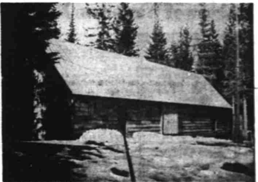
This combination warehouse and trading post has just been completed in time to stand its first winter test at Boy Scout Camp Pioneer in the Cascades below Mt. Jefferson. Measuring 36 by 86 feet, it has an aluminum roof designed to withstand any probable snow pressure.