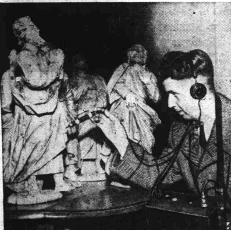
WORM-LISTENING DEVICE — An engineer at Leverkusen, Germany, tests a microphone and amplifier that magnifies sound 10,000 times, can locate tiny worms gnawing in wood.