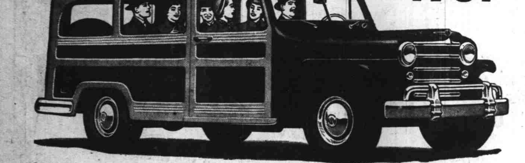
Grille and grille guard optional at extra cost.

Here's why Now's the Time to Buy Used-car markets are firm. Your car will probably bring more today than it will a few months from now. Drive in today for an appraisal.