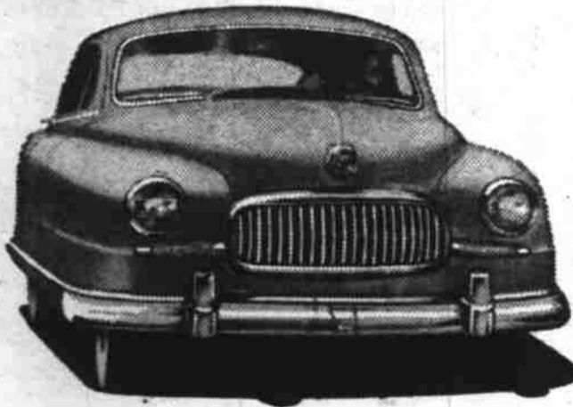
The 1951 Statesman

★ Drive the car that delivers more than 25 miles to the gallon at average highway speed. It's the biggest, roomiest car in its price class. Now available with Hydra-Matic Drive!