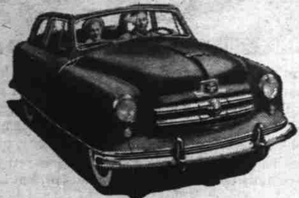
The 1951 Rambler

★ One of the greatest road performers of all time. In the Pan-American Road Race a Nash Ambassador averaged 95.3 miles per hour for 712 miles. Compare it with any car! Hydra-Matic Drive is available.