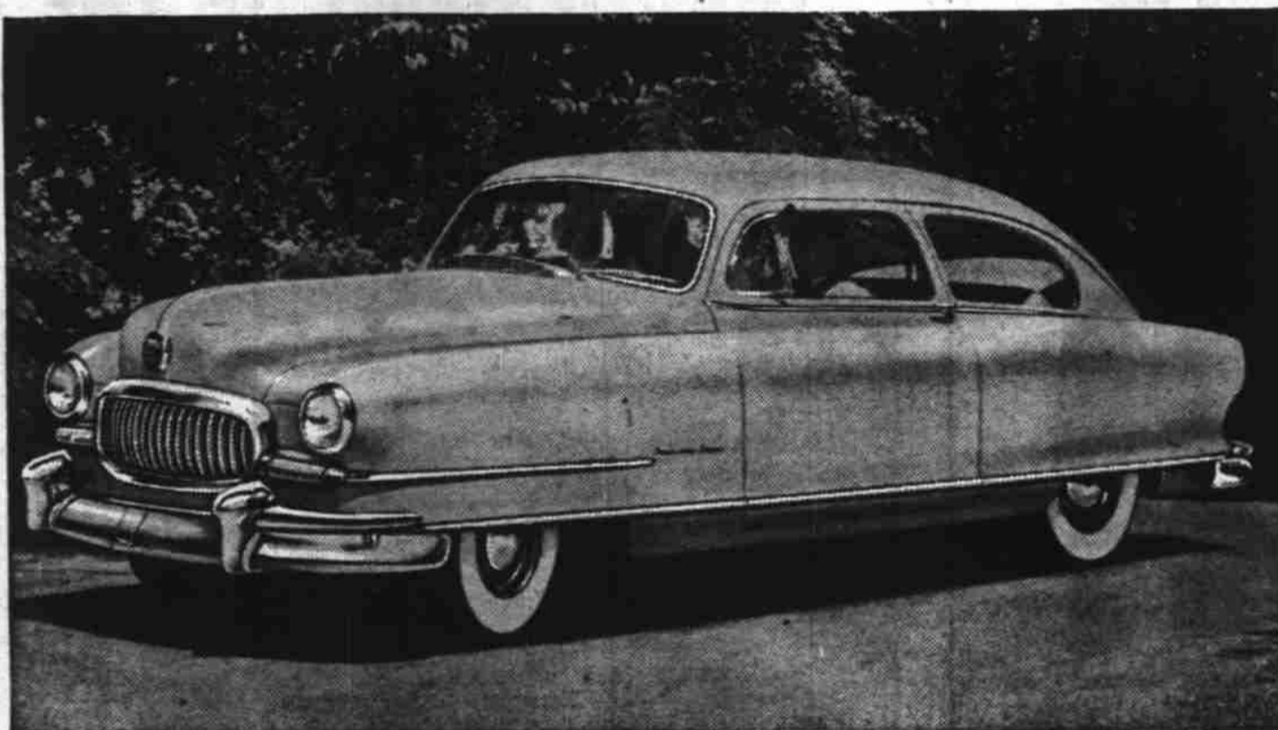
The 1951 Ambassador

★ Drive the car that delivers more than 25 miles to the gallon at average highway speed. It's the biggest, roomiest car in its price class. Now available with Hydra-Matic Drive!