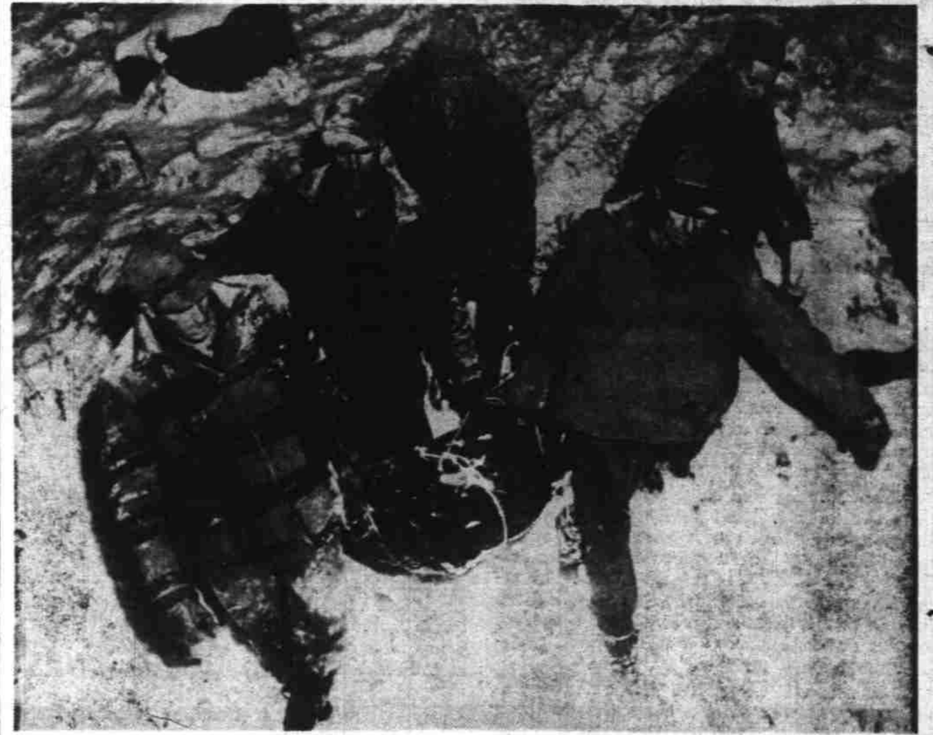
BUTTE, Mont., Nov. 9—Weary workers pack out packaged bodies from the scene of the plane crash which killed 22 near here Tuesday. The Northwest airlines plane crashed and burned Tuesday morning on a westbound flight to Seattle.