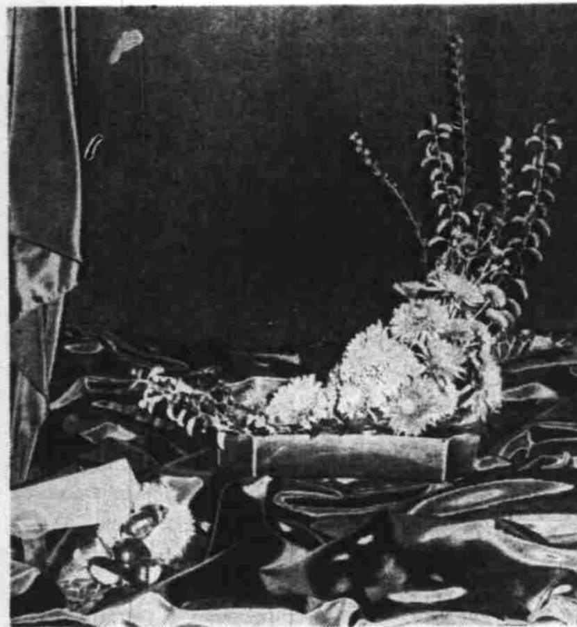
SALEM HEIGHTS — One of the outstanding flower shows of the fall season was staged Saturday by the Little Garden club of Salem Heights. Shown is the outstanding exhibit entered by the Salem Garden club which took first place in the garden club division.

From The Oregon Statesman's Valley Correspondents