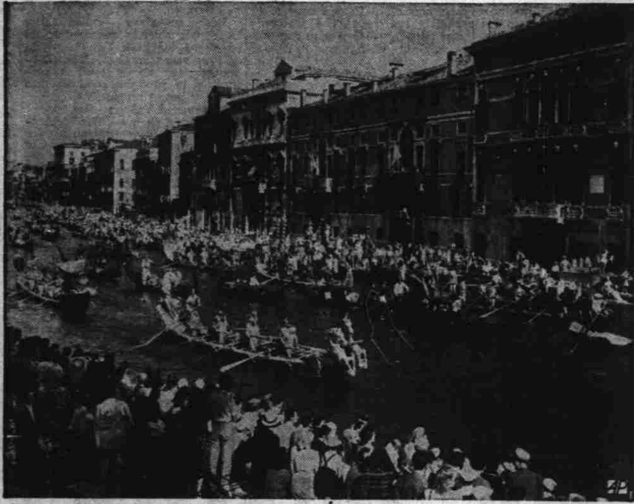
RECALLING DAYS OF OLD —Spectators line the Grand Canal, Venice, during the city's annual water carnival as gondolas parade over routes used by the Doges centuries ago.