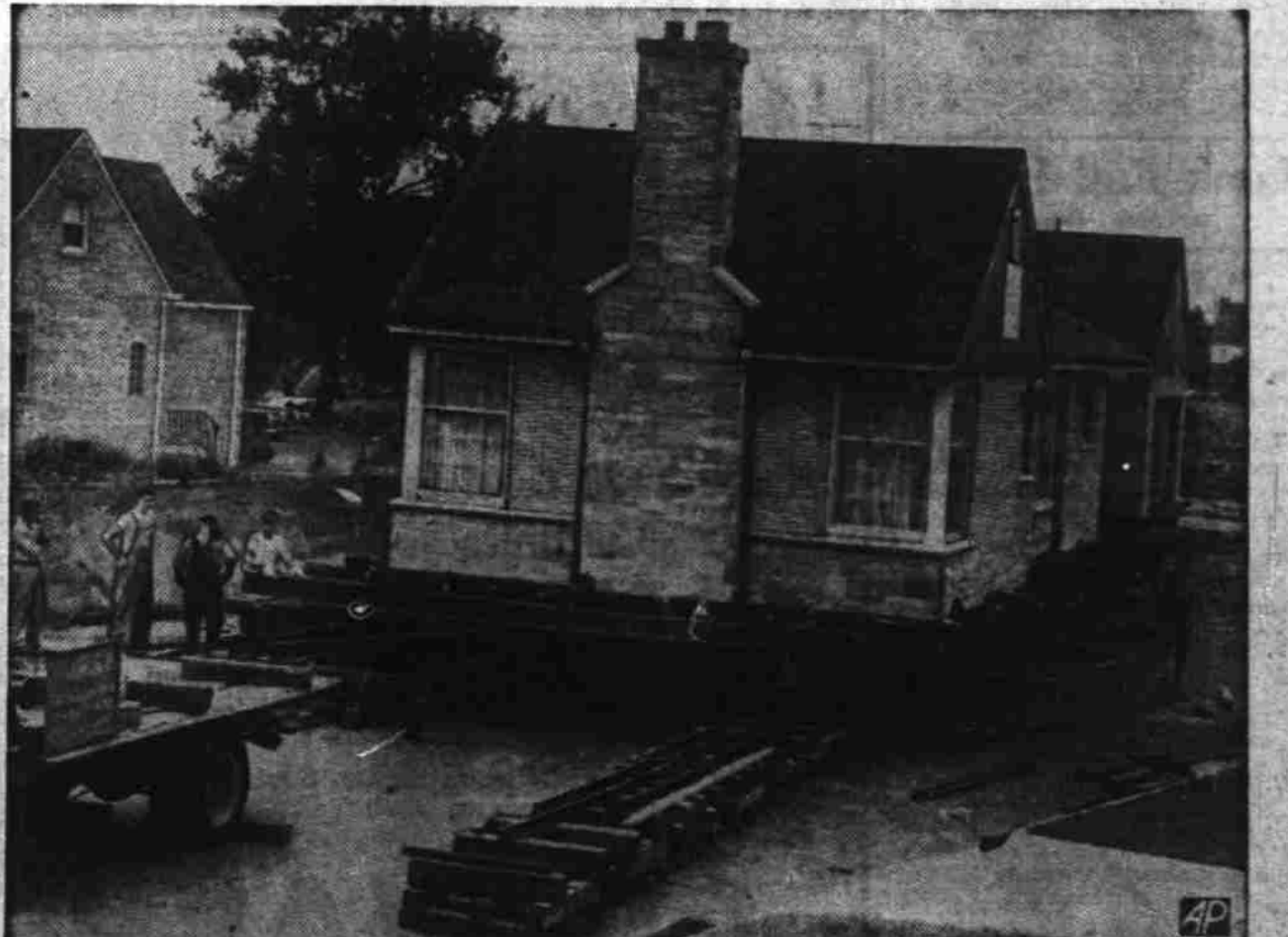
HOUSE-MOVING DAY IN CHICAGO —Workmen move a stone and brick house valued at $40,000 from one Chicago site to another to make room for a new department store.