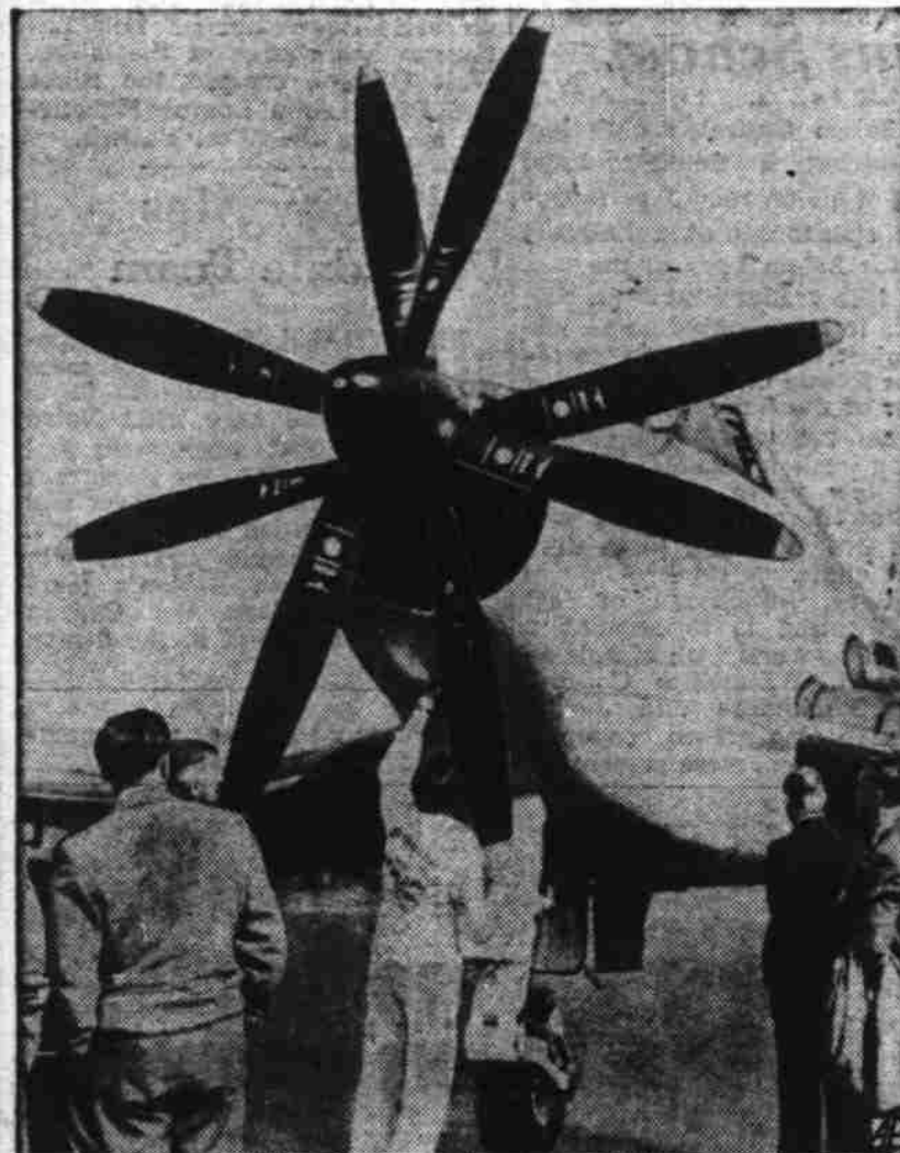
MULTI-BLADE PROPULSION —Eight blades are used of the British Navy's YB1 plane which was shown at the British Aircraft Constructors exhibition, Farnborough.