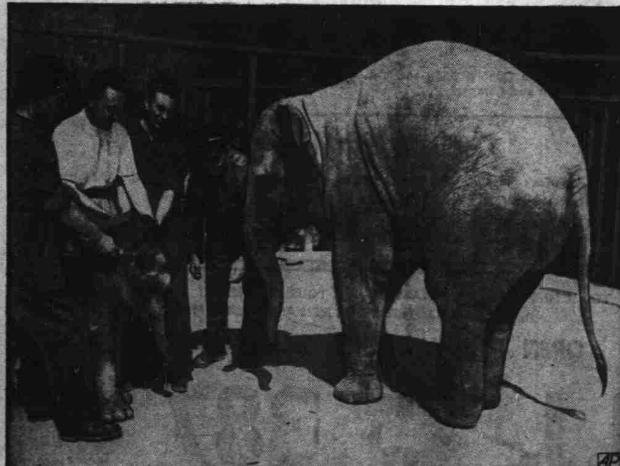
A NEW MEMBER OF THE FAMILY —Remo, a week-old elephant, is carefully guarded during his first meeting with his three-year-old sister, Roma, at Rome, Italy, Zoo.