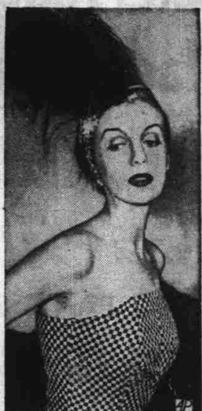
DESIGN BY DACHE —The corselet theme is interpreted by Lilly Dache in a strapless evening bodice of black and white checked damask sprinkled with gold sequins.