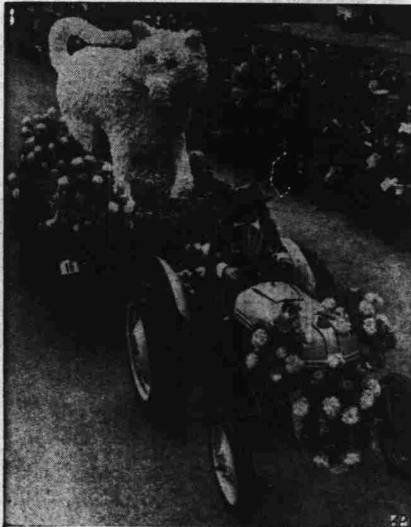
PARADE HIGHLIGHT —A floral "Puss in Boots" drawn by a tractor amuses spectators as products of the Dutch flower center of Aalsmeer are exhibited in an Amsterdam parade.