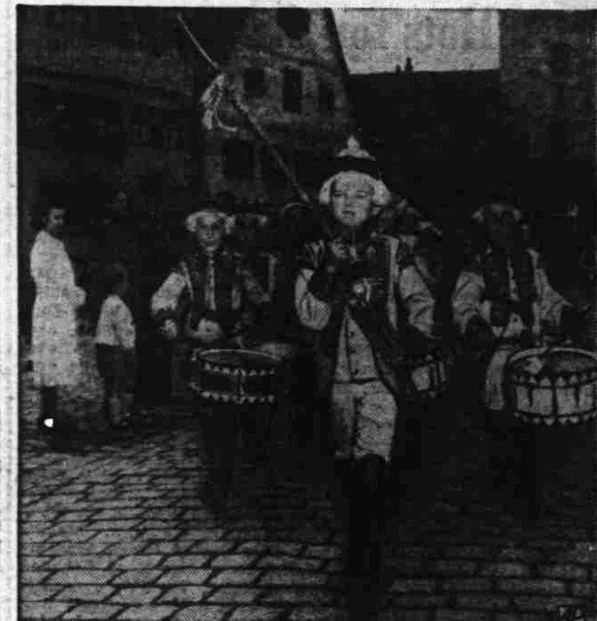
THE LEADER STEPS OUT —This smart-stepping drum major heads a costumed boys' band during a shepherd's festival in the German town of Dinkelsbuehl, Bavaria.