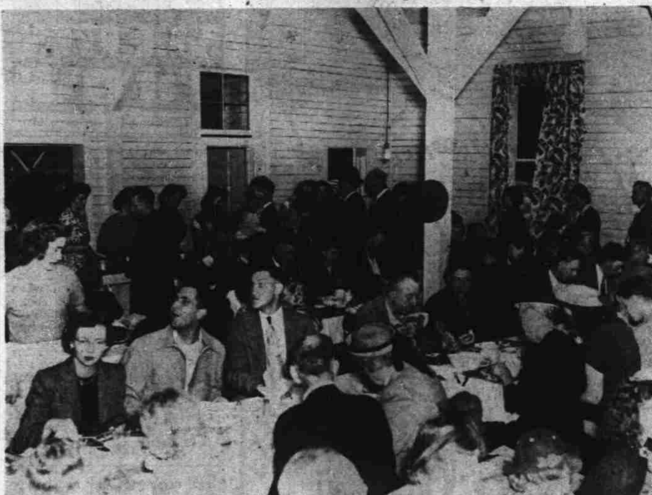
JORDAN — Pictured are a part of the more than 1,000 persons who crowded into the Lady of Lourdes parish at Jordan Sunday to attend the annual Jordan bazaar. Despite a drenching rain, the event attracted the largest attendance in history. Proceeds will go to the parish school building fund. It was the fifth annual bazaar held since the end of World War II.