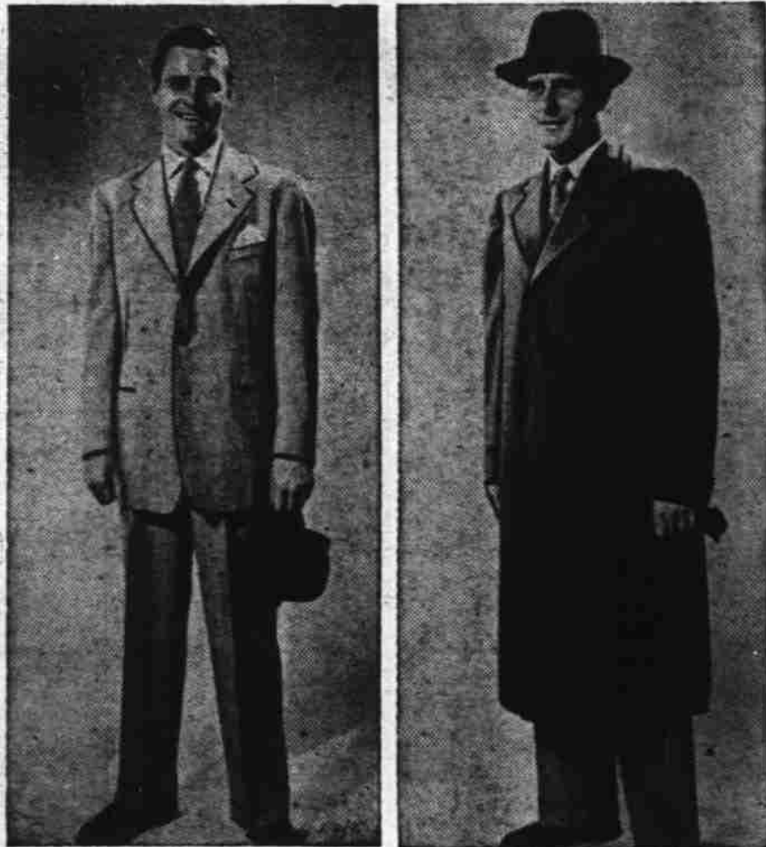
Crisp and long-wearing wool sharkskin is making Fall fashion news in this clean-cut, single-breasted model. A business man's favorite. Men's wear fashion leaders have chosen this new coat of fine wool cover as a leader for Fall, 1950. It has modified square shoulders.