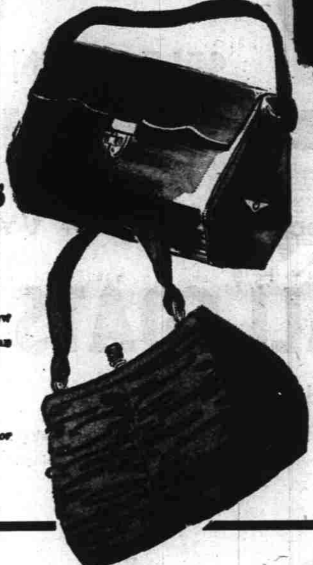
Handbags, main floor

Beautiful styles . . . to hold all your essentials, to complement your bright new wardrobe! Black, Brown, Red, Wine—in fact every fashionable color you can want. Just two shown from a wide variety of tailored and dressy models.