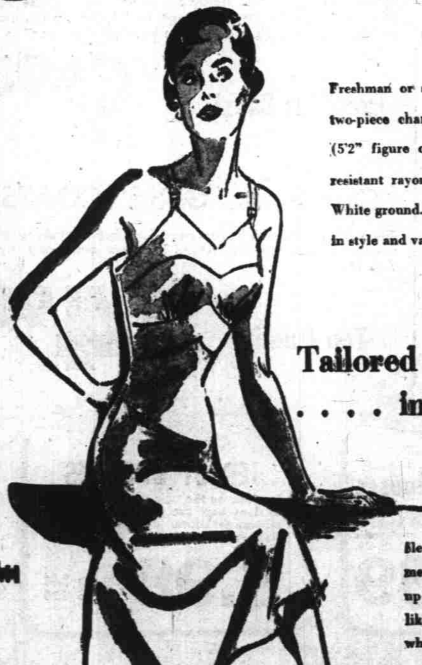
Dresses, second floor

Freshman or senior—you'll be belle of the campus with this two-piece charmer! Designed specially for the Junior Petite (5'2" figure or under) . . . fashioned in smooth wrinkle-resistant rayon . . . in Navy, Black, Brown, Green checks on White ground. Advertised in "Seventeen"—so you know it's tops in style and value. Sizes 9 to 15.