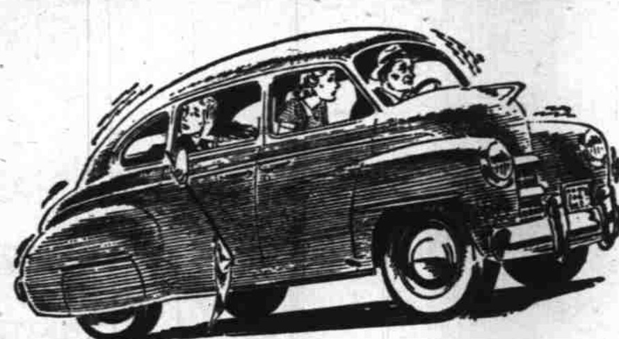
If gummy gasoline's making your engine feel like the smallest part of your car...