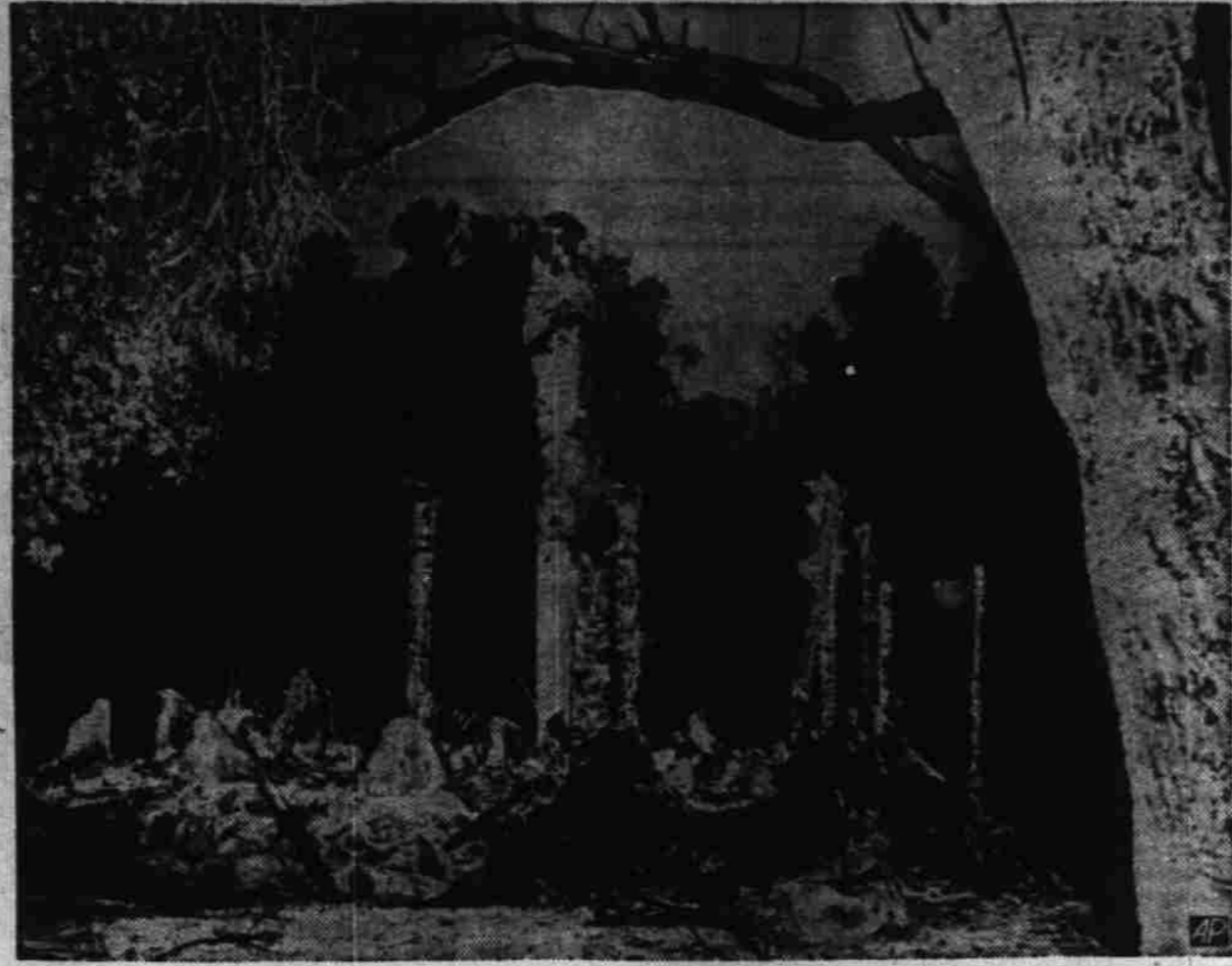
SAN DIEGO, Aug. 20—Standing stone work is all that remains of the Gibson residence in Descanso Park, within blackened area of Cleveland National Forest and Cuyamaca State Park, near San Diego, Calif., where 60,000 acres of brush and timber have been burned in 4-day fire, and approximately 20 homes destroyed. Blaze is still out of control, threatening heavily timbered Laguna Mountain Recreation Area, one of the state's leading resorts.