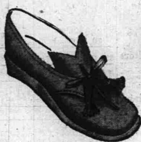
Misses' "Doodlebugs" 4.98

Jaunty little shoes with snug drawingstring tie, made on comfortable nature last. Smooth or soft finish leathers in saddle . . . 4-9.