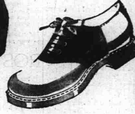
Misses' Saddle Oxfords 5.90

So comfortable, flexible, sturdy! Goodyear welt construction, elk-finish cowhide uppers, soles of top-grade Neolite. Brown, 3½-10.