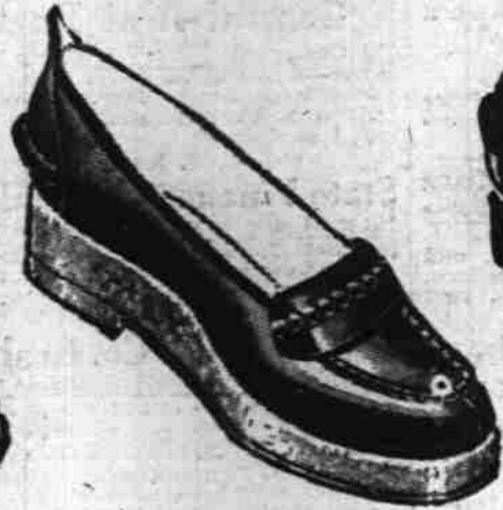
Cherry Lane Casuals 3.98

Jaunty little shoes with snug drawingstring tie, made on comfortable nature last. Smooth or soft finish leathers in saddle . . . 4-9.