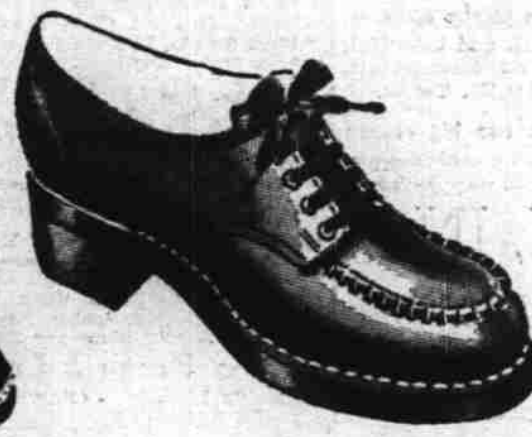
Misses' Fall Oxfords 3.98

Favorite double-buckle style in soft, handsome kip leather with sturdy, non-marking Neolite soles . . . in Goodyear welt construction. Brown. 3½-9.