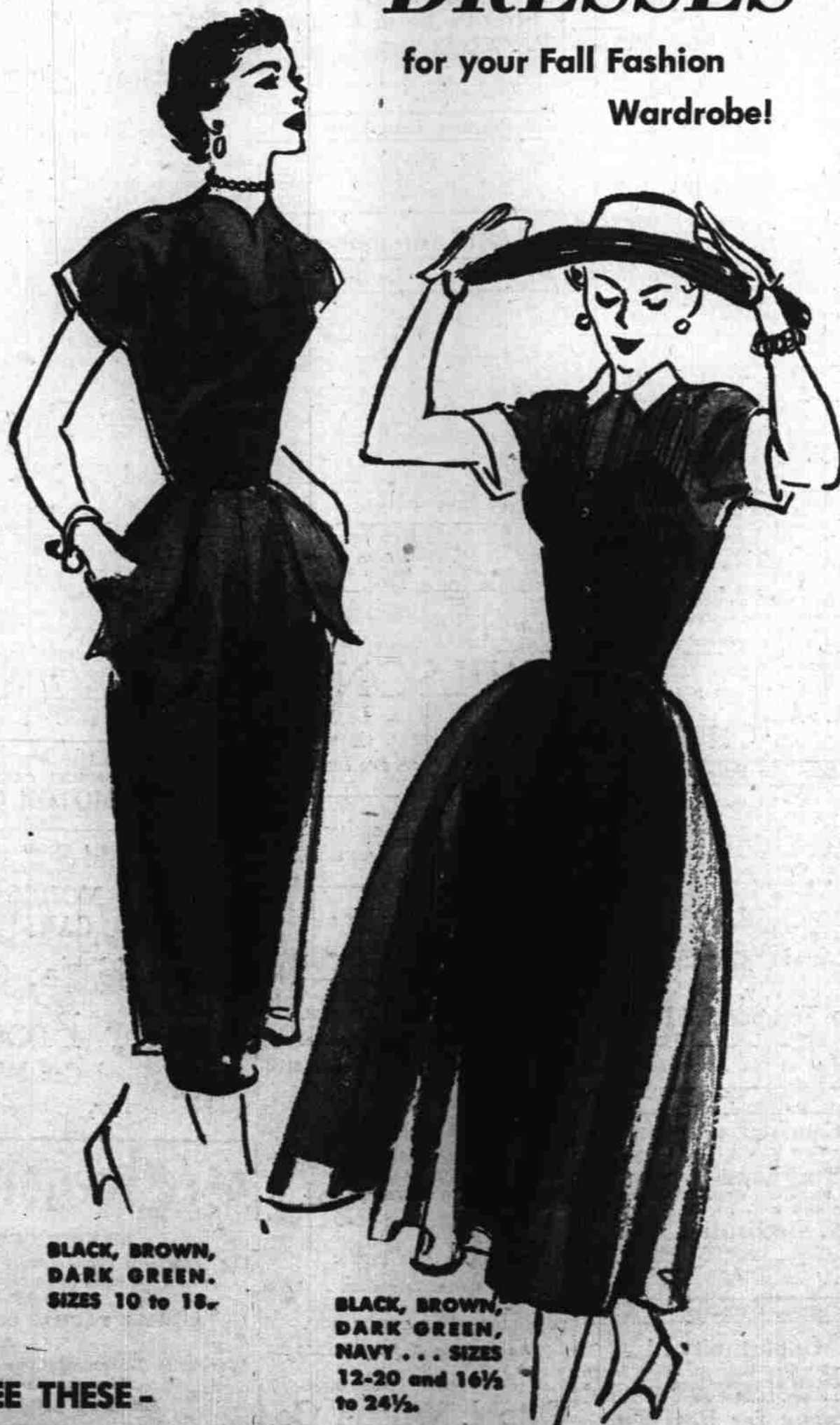
BLACK, BROWN, DARK GREEN. SIZES 10 to 18.