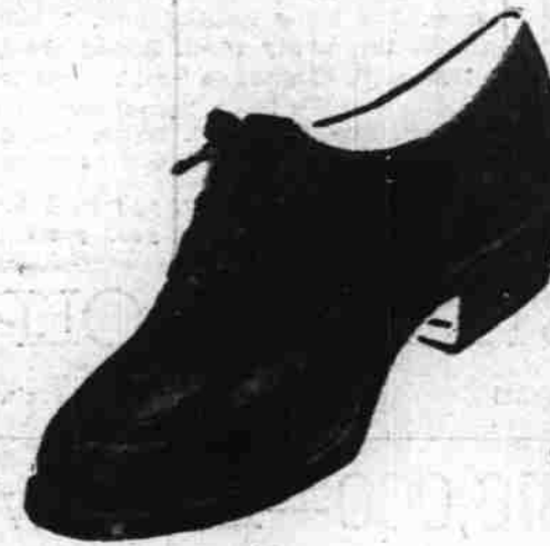
Sturdy Moccasin Oxfords 5.50

And that's LOW for this expensive-looking, well-made moccasin shoe! Elk-finished cowhide uppers, flexible, heavy rubber soles. Brown, 3½ to 10.