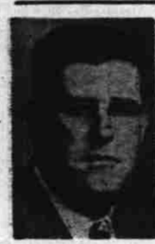
Dr. E. E. Boring