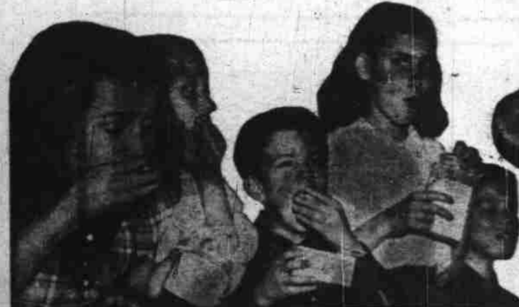
The jury gobbled up the evidence! They couldn't wait. They ate it in their fingers. They ate it right out of the box. "Pops is tops!" the Junior Jurors yelled. "A sweet-tasting cereal that's good without sugar!" Kellogg's great new corn cereal is in!