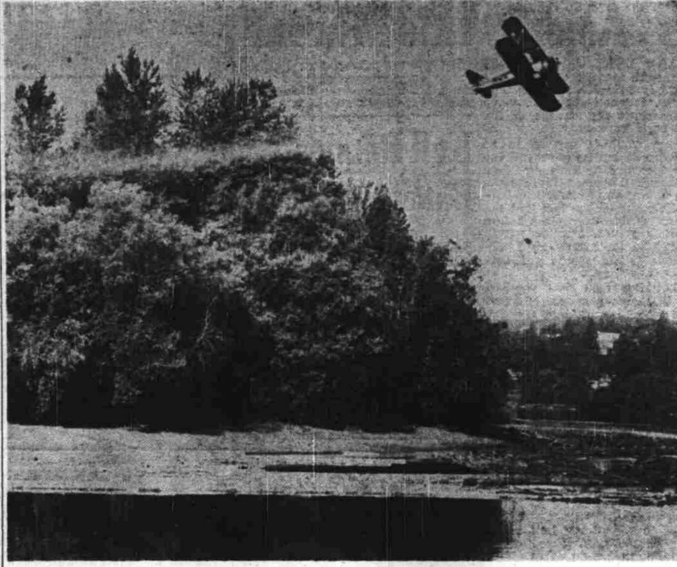
Skeeters will sing a death song when they take a sip of the spray trailing from behind the airplane, above, skimming over Willamette slough behind the Oregon Pulp and Paper lumber mill early Monday morning. All mosquito breeding grounds in the Salem vicinity are being sprayed with a special insecticide which is harmful only to the needle-nosed varmint and a limited number of other insects. Aircraft of the Ace Flying Service will dump 800 gallons in the control effort by the city of Salem.