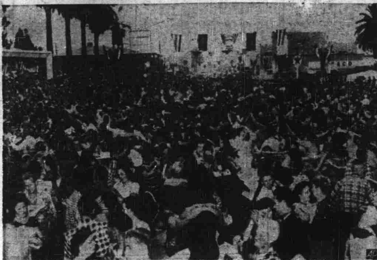
SANTA MONICA, Calif., July 15—Eight thousand costumed "do-it-do" fans participate in the "world's largest square dance" at Santa Monica, Calif., a feature of Santa Monica's 75th Diamond Jubilee Celebration that required five blocks of Wilshire Boulevard pavement for a dance floor. Thirty-six callers directed the dancers while 50,000 spectators looked on.