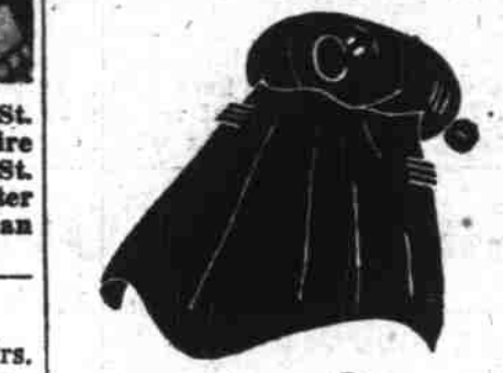
Cioppino Cravers do it!