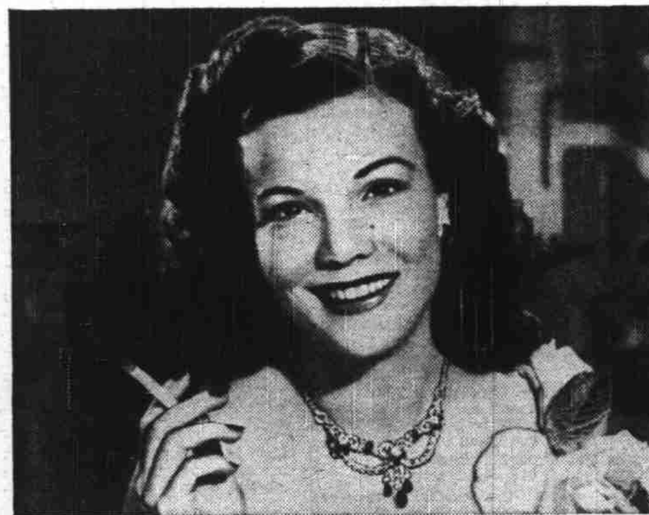
NANETTE FABRAY, who has played lead roles in almost a dozen top-flight Broadway musicals, guards her precious voice with the utmost care. In a recent interview, she said: "As a singer, I especially welcome Camel mildness. Camels agree with my throat. And they taste so good!"