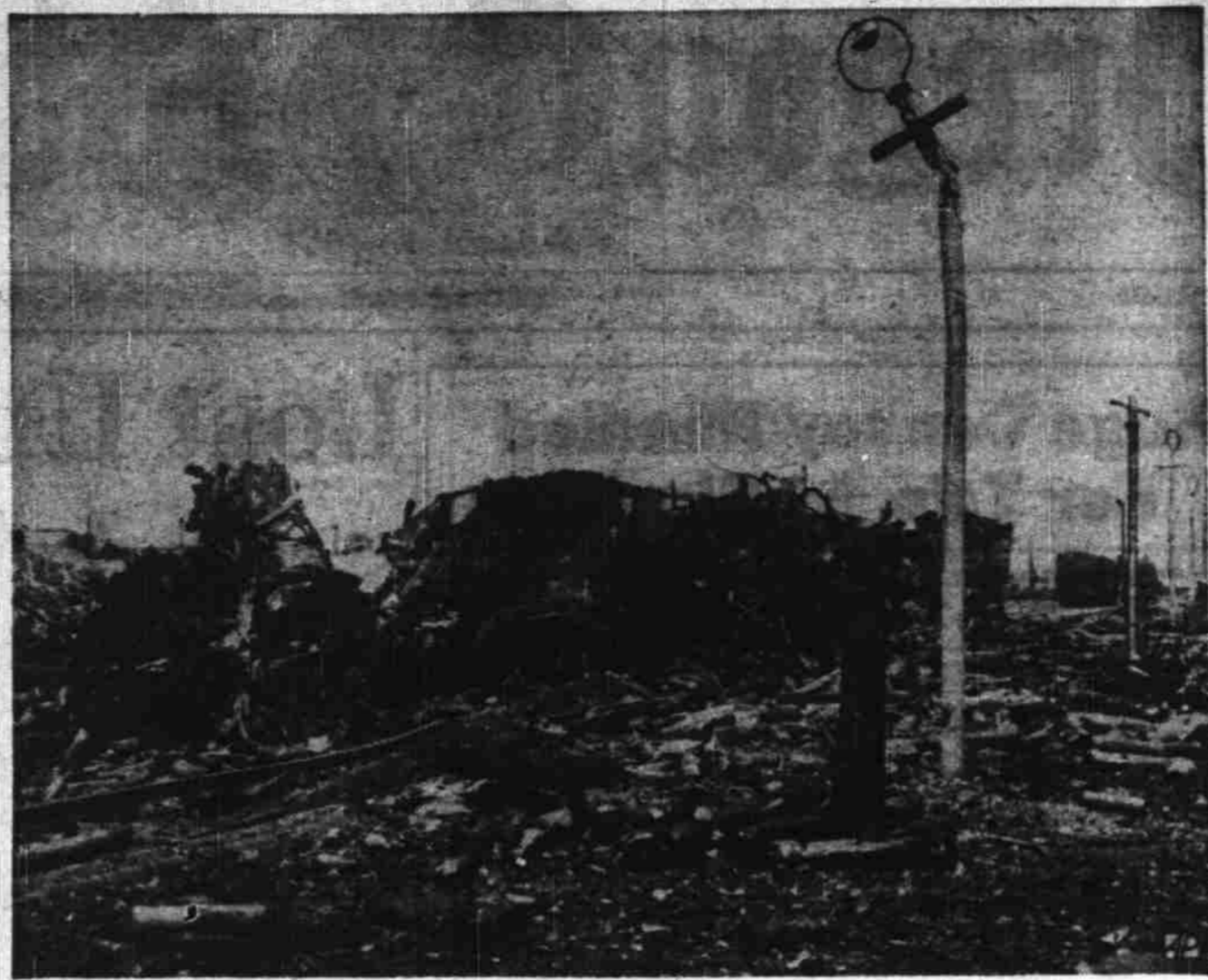
SOMEWHERE IN KOREA—These twisted pieces of metal with projectiles and shell casings scattered around were all that remained of a South Korean ammunition train caught by strafing and bombing North Korean planes in the railroad station at Fyongtack, 20 miles south of Suwon.