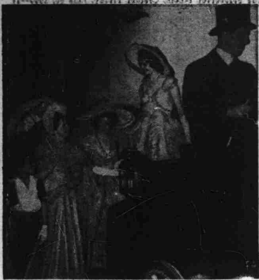
GOING BACK FIFTY YEARS —Mannequins of the fashion houses, in costumes of the early century, celebrate the 50th anniversary of the Avenue Victor Hugo, in Paris.