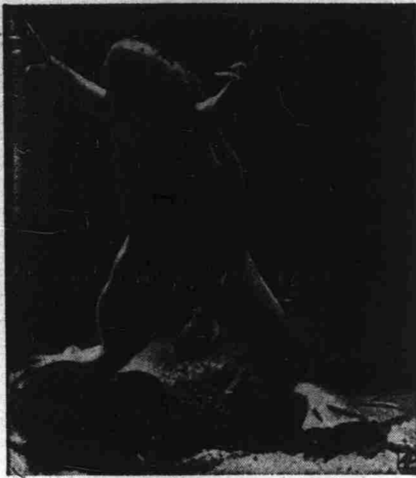
FINGERED FROG —A South African fingered frog, imported for laboratory research, stands above another frog and reaches for food in Fish and Wildlife Aquarium at Washington.