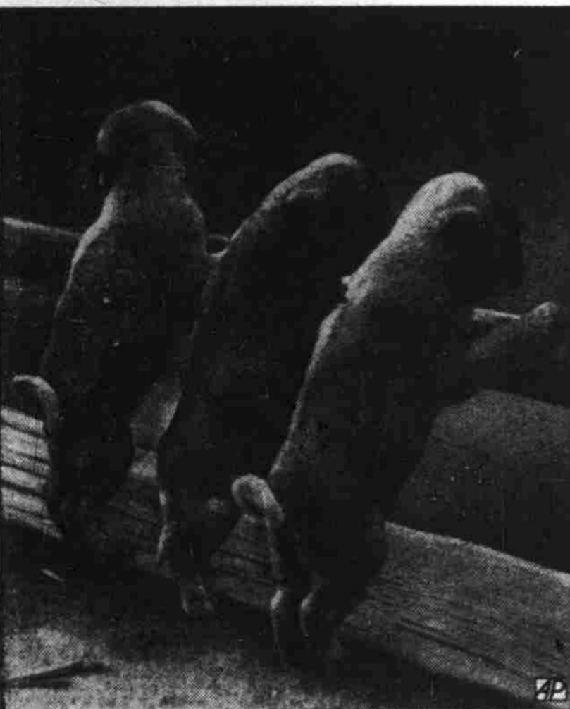
NEW VIEWPOINT —Three pug pups that wandered from their owner found something to wonder about as they lined a rail to stare at the goings-on in Sydney Harbor, Australia.