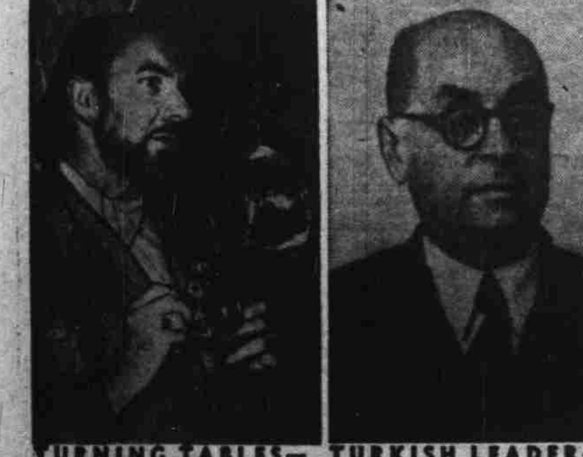
TURKISH LEADER—Celal Bayar (above), son of a school teacher, is the new President of Turkey following the victory of the Liberal Democratic party in recent elections.