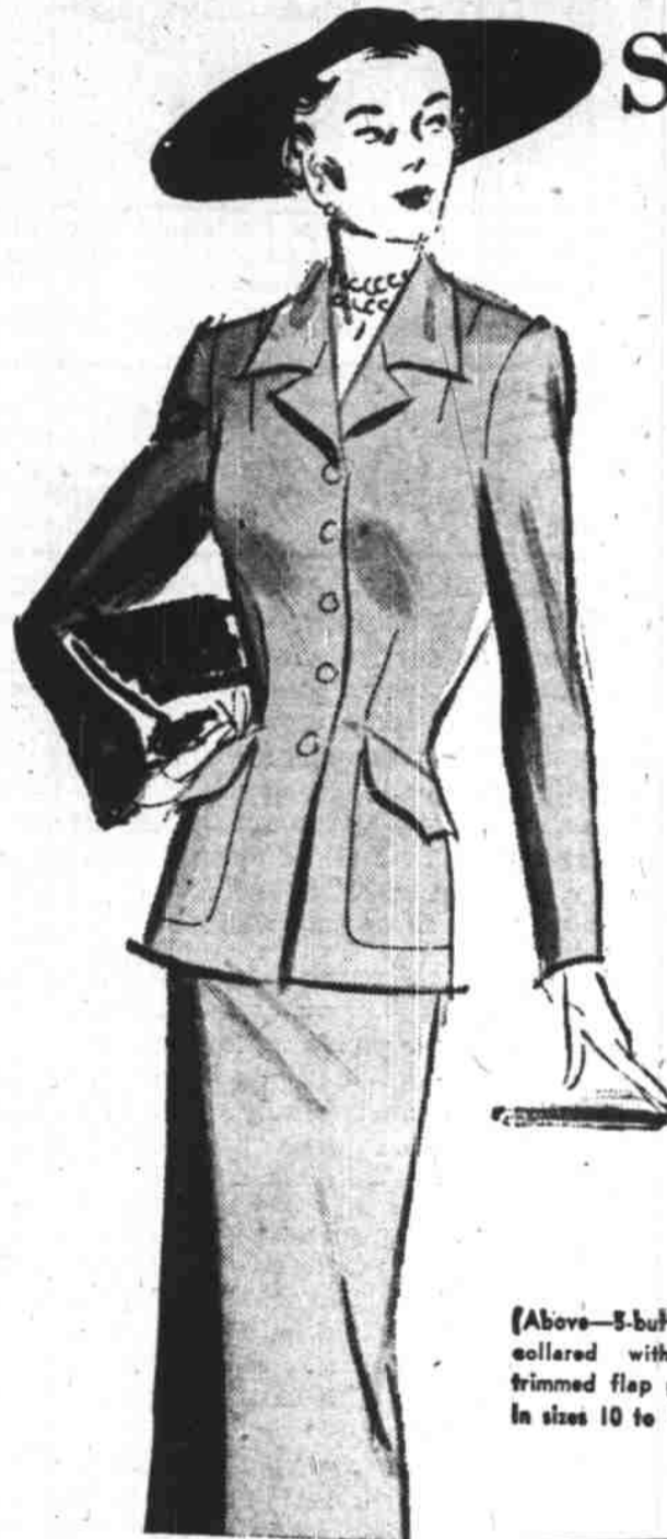
(Above—5-button, club-collared with button-trimmed flap pockets in sizes 10 to 18.)

Sale! Cool, crisp and wrinkle-resistant Summer-Weight Suits... Reg. $19.95