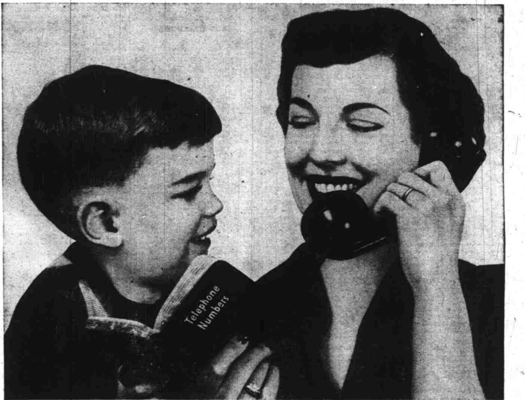
If you keep a list of out-of-town numbers, you'll find calls are put through much faster—often in 30 seconds.