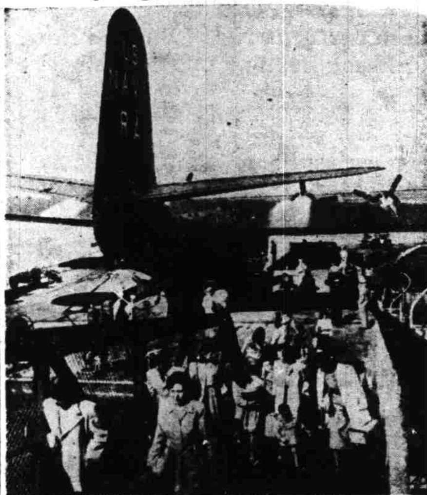
ALAMEDA, Calif., April 23—Wives and children of Navy officers and men stationed on Midway Island walk up the deck of Alameda (Call) Naval Air Station after their arrival aboard the Navy's Hawaiian Mars from Honolulu. The 19 wives and 33 children were the last remaining dependents on the tiny Pacific island which the Navy is closing for economy reasons.