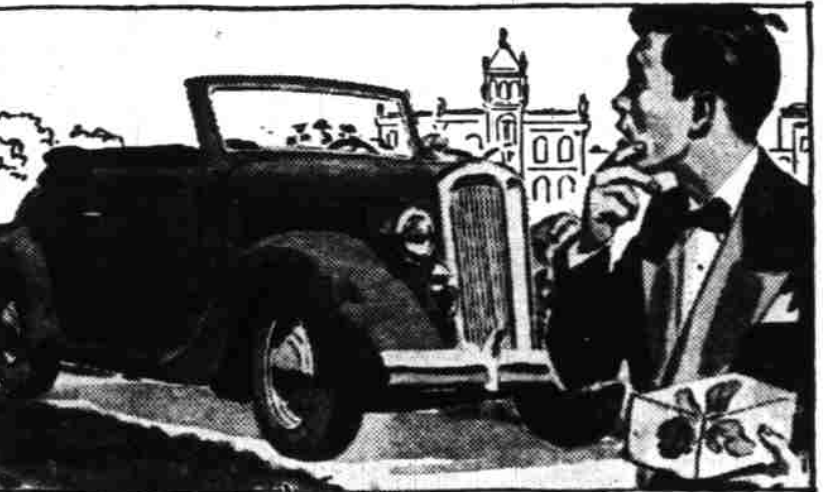
Why let gummy gas spoil smooth dates with stumbling performance?

Chevron Supreme – Super-refined to remove power-robbing gum!