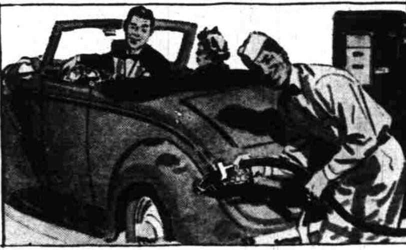
Just use smooth, powerful CHEVRON Supreme—it's Super-refined